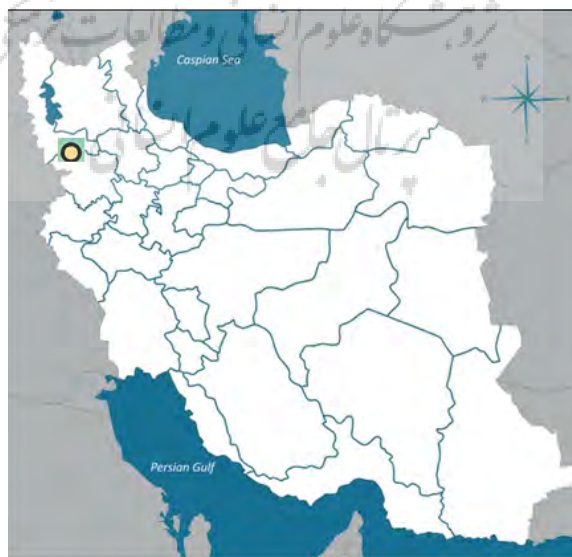
Fig. 2: Case study Region.

latitude and the height from the see is nearly 1496 meters (Fig. 2). According to the last official census (2012), the population of Saqqez is nearly 208,425 which among these, 150000 live in city center and the rest live in other towns of the city. The city area is equivalent to 15.49 % of the total province area. Saqqez is surrounded by West Azerbaijan in North and West, by Marivan and Iraq in South, by Divan dare in East (Consulting Engineers of Piravesh, 2007).