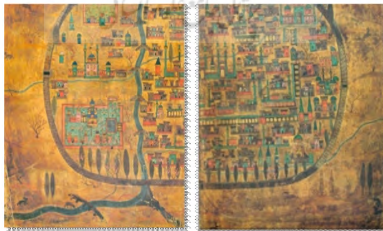
Fig. 1: Tabriz miniature drawn by Nasuh in 1536 AD

According to Albert Gabriel, the analysis of the structure of Istanbul shows that these images can be used as city maps which in addition to the information on the topography; reflect the architecture type from Ottoman view. The image analysis also helps in determining the internal structure of cities according to contemporary methods (Kosebay, 1996). Walter Denni, an American researcher, studied the details of the Istanbul's map written by Nasuh. The title of his study is "The Architecture of Istanbul in the sixteenth century". In this work, the researcher attempted to compare the illustrated buildings with the existing reality. According to him, some tombs, especially those located in large cities, from the viewpoint of architecture and topography are consistent with reality. Among them, however, some are similar to each other and copied each other. He has completed the list produced by Gabriel through indicating the possible similarity of 121 locations which has been numbered by him. Thus, the images of Istanbul, Diyarbakir,