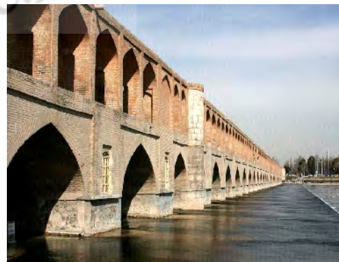
Fig. 6: Si- o- Si Bridge, Isfahan