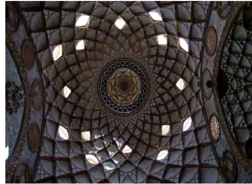
Fig. 8: the Great Sun in the circle of prophets, on the ceiling the house of Boroujerdies, Kashan

representative of eternal response of human to “the god question.” 4 This means final return to the main homeland, the Heaven.