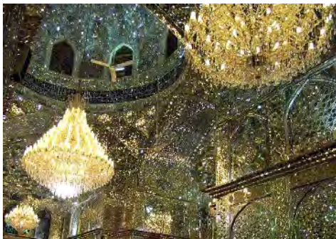
Fig. 3: Mirror's game in the sacred space, Shâh-e Cherâgh, Shiraz

From this point of view, the meanings of beauty and ugliness could be defined as well. Getting approach to God gives one the power of seeing him more and more unveiled as the most beautiful being. The ultimate measure of beauty is completely revealed with no hidden point in presence of God, the highest place of heaven that is called the Truth of Mohammad, the Perfect Man. One who tries to actualize the granted power in her/his heart will be honored to be accompanied by God in the promised paradise 1 . So the residents of Heaven are allowed to see the divine beauty, the absolute beauty. Accordingly, the knowledge is equivalent to conceiving the beauty. As much as the former goes higher, the latter follows it exactly as specified. Thus dwelling in Heaven means to gain the ultimate knowledge in order to obtain the ability to see the beauty (Fig.4).