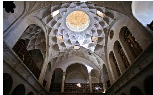
Fig. 4: The House of Ameries, Kashan