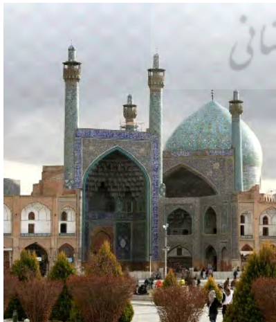
Fig. 5: the tree aspects of The Truth as the Tree of Life with its two guardians which is realized as the gate or the dome with two minarets, The Mosque of Imam, Isfahan

Mohammad is the one who extends from the embodied human on the earth to the Heaven, the God; a historical person as the Prophet to the Perfect Man as the source of being. Now we reach another element of Heaven: bridge as a road from earth to Heaven that is called Chinwad puhl in Zoroastrianism and Serqt in Islam. In Sufism, the Perfect Man is the straightway from earth to Heaven who is no one but Mohammad. Here a similarity between Mohammad and the bridge (33 Bridge) may be observed again. Lotus is a mediatory being between clay, water and light as the source of life. Hence it is