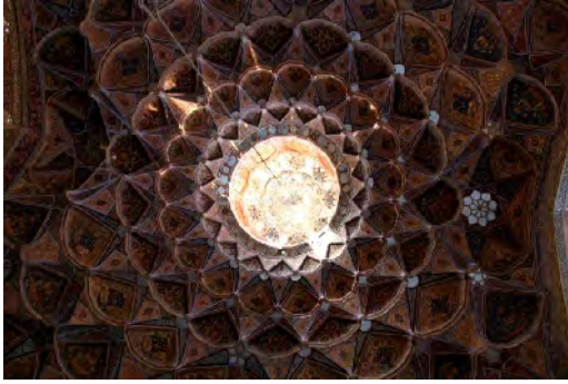
Fig. 1: Allah is the light of the Skies and the Earth, Hašt Behešt, Isfahan