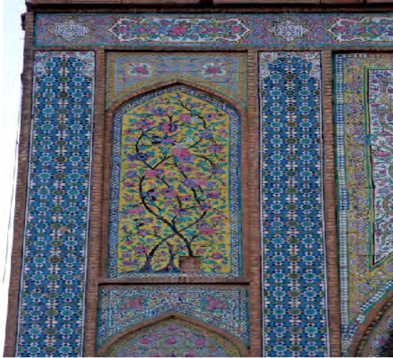
Fig. 7: Tree of life on the tiles of the Ivan of Masjed-e-Vakil, Shiraz