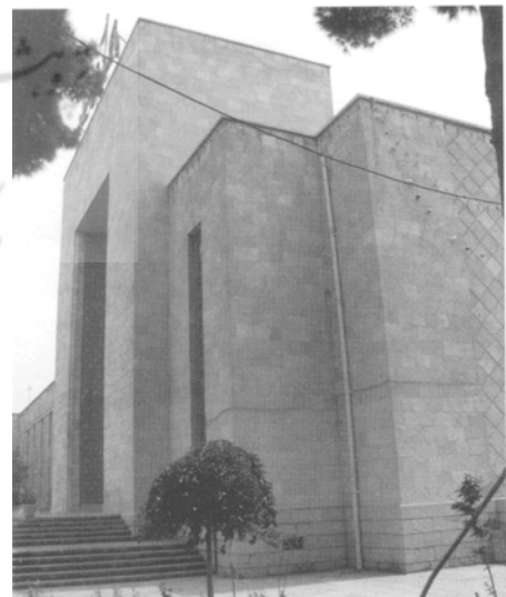
Fig. 8: Isfahan National Bank, by Mohsen Foroughi, 1942