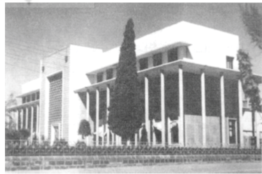
Fig. 2: Iranian National Bank by Mohsen Foroughi, Shiraz