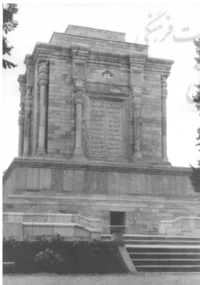
Fig. 5: Ferdowsi;s Tomb, by Karim Taher zadeh Behzad, Toos, 1934

Only features of pre-Islamic architecture were considered. Columns, Column capitals, stairs and ornamental designs and so on were borrowed from Sassanid and Hakhmanid eras. of course, respecting the necessity of devising new functions there was no need for considering the pre-Islamic pattern of