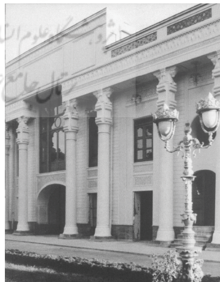
Fig. 6: North side of National consultative Assembly by Karim Taherzadeh Behzad, Tehran,1936