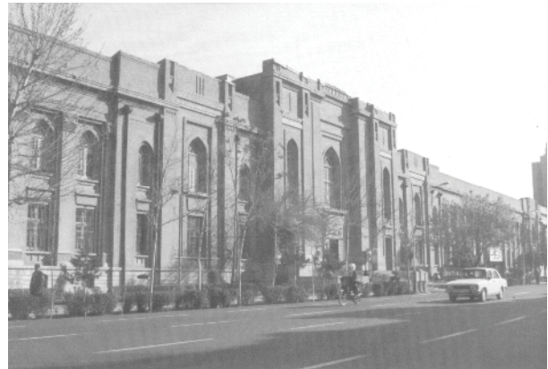
Fig. 4: Central Post office, by Nicholai Markov Tehran, 1934

plan design and architectural space . Buildings constructed in this period with ancient nationalist tendency can be studied as 2 following types: