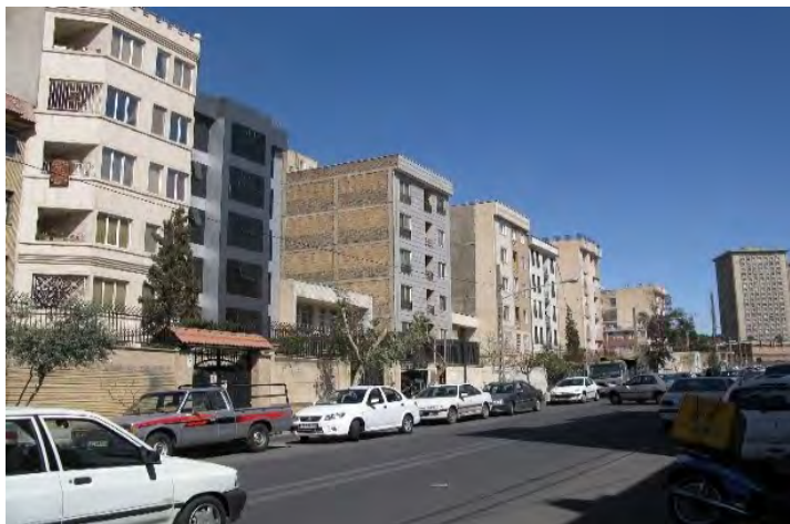
Fig. 2: Lack of unity between adjacent building facades decreased the aesthetics and attractiveness

warm creamy color stone as the dominant color and material of a residential building facade. While participants preferred a variety in building façades, they also appreciated unity between adjacent buildings (Fig. 2). However, one participant positively attributed the lack of harmony to the freedom in choosing a personal favorite façade.