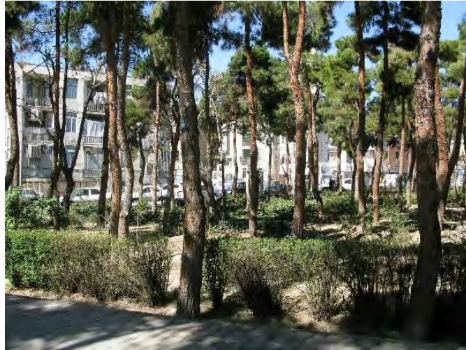
Fig. 3: Pine trees with tall leafless trunks could not protect the main local park visually and audibly from traffic around

birds singing, a murmur of water flow, and the rustle of leaves underfoot) during walking pleased participants. The movement of water (e.g. working fountains) was more desirable than still water because of its sound and the possibility of touching water drops especially in summer.