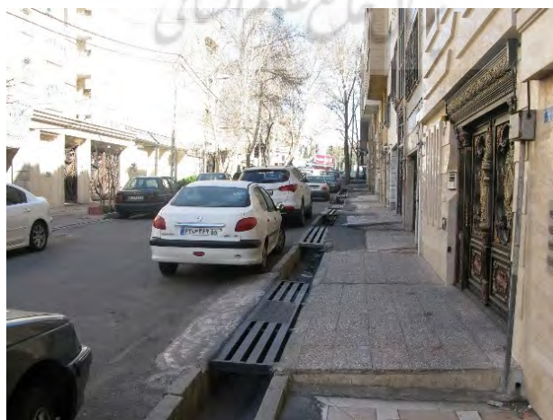
Fig. 1: The presence of frequent one-steps enhanced trip hazards.

Lack of air temperature balance during winter and summer especially winter reduced the extent of participants' walking.