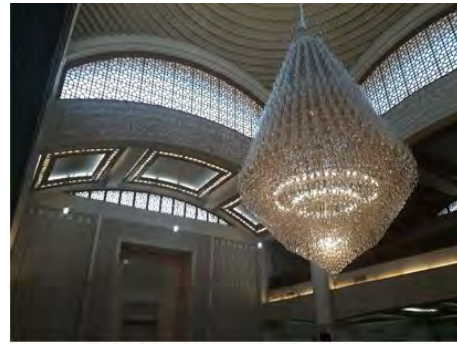
Fig.4: A bottom view of the dome