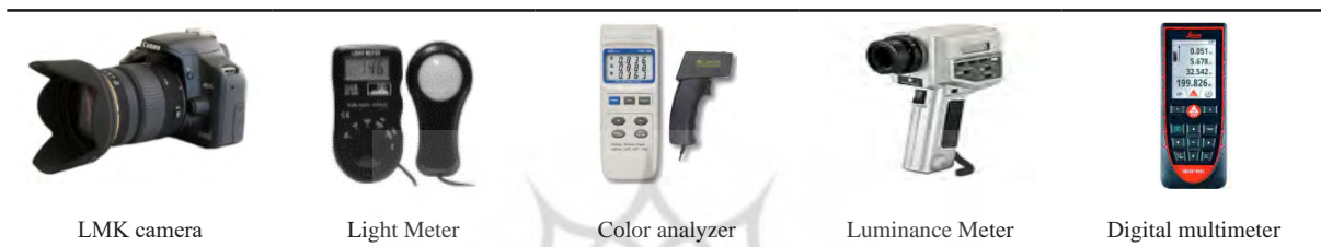
Table.1: Measurement devices used in this research

the output data were analyzed in summer solstice (June 22) and winter solstice (December 22). ‘Solstices were selected due to light variation and position of the sun in the longest and shortest day of the year as well as the highest and lowest angle of solar radiation. (Hoomanirad & Tahbaz, 2014).