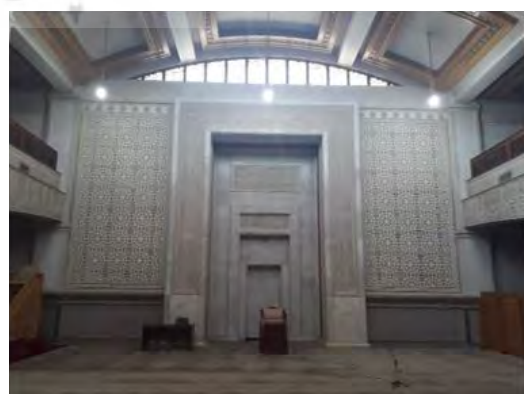
Fig.2: Shabestan and Mihrab