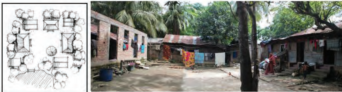
Fig. 4: (Left) Typical courtyard plan; (Right) Photograph of a typical courtyard