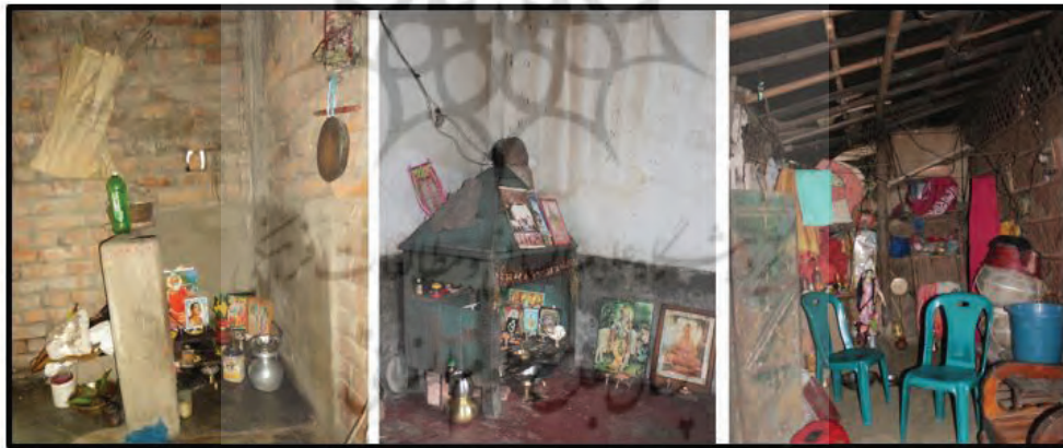
Fig. 3: Religious space of the house

When the household size increases, they need to extend the house. Generally, the extension is done on the backside of the house where the kitchen is built. By shifting the kitchen, another sleeping area is added if possible. The bamboo mat wall is used for room extension and partition wall. The roofing materials are kept similar to the original house. At present due to the insufficiency of spaces in the village, inhabitants have to construct a new room next to an existing housing unit sharing a