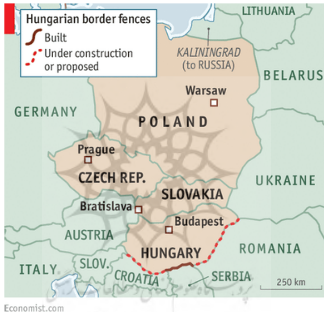
Figure 3: Visegrad 4 Countries and fencing the borders

the 1989 borders and the Iron Curtain were against us, but the current border is for protecting us. Another joint effort to counter the influx of asylum seekers was the formation of the Visegrád Police, which works to assure the ultimate protection of Hungary's borders (Kazharski, 2017, p. 19).