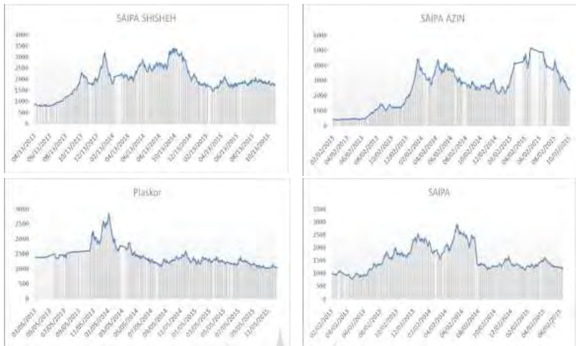
Fig. 2: The Stock Price of SAIPA Supply Chain Companies Since 17.02.2013 to 14.12.2015 Source: Rahavardnovin Software