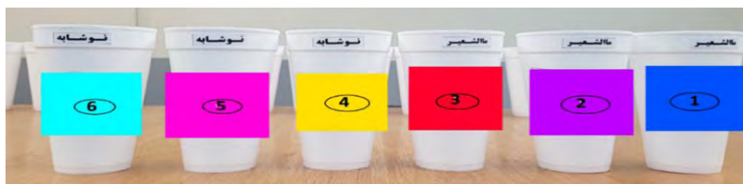
Fig2. AOIs of one of the arrangements of beverages

To verify the first hypothesis (H1), consumers' answers in their questionnaires and their selections in the experiment study arrangements were analyzed. Interestingly, for all the arrangements in the experimental group, the T-test results showed a statistically significant difference (Table3) between consumers' answers in their questionnaires and their selections. Table3 shows that the mean of consumers' selections in questionnaires is 1.66 and the means of consumer' selections in different arrangements are 1.33 and 1.38. While, in the control study, the mean of consumer' selections from different arrangements is 1.66 too. Additionally, the results showed that when there were no popular brands of favorite category, 75% of the participants changed their choices and selected a popular brand of unfavorable category