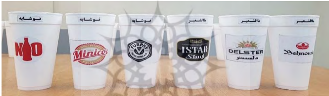
Fig1. One sample of arrangements

Therefore, each participant had to select one glass from ten different arrangements independently. The picture of one sample of arrangement is displayed in Fig1.