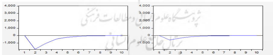
Figure 2. The Response of Profit to the Allowance for Doubtful Debts and Non-Performing Loans.

To study the relationship between profitability and non-performing loans, the Bayesian Vector Autoregressive model is applied in this paper based on the Sims and Zha (1996) approaches estimated with three variables: net profit, allowance for doubtful debts, and non-performing loans. So one can estimate the net profit immediate response to the shocks of the allowance for doubtful debts and non-performing loans, as shown in Figure (2):