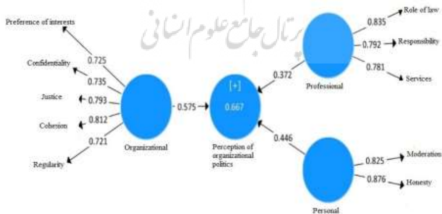
Figure 1: Test of research model in standard mode

Based on fig. 1, the path coefficient of the organizational variable is equal to 0.57 and the path coefficient of personality and job dimensions are 0.44 and 0.37, respectively. Accordingly, the organizational dimension is more related to political ethics than other dimensions.