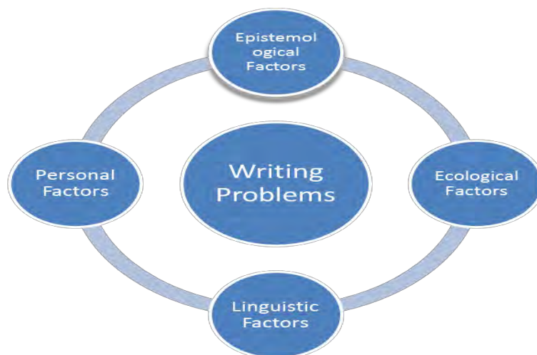
Figure 1 The Main Sources of Writing Problems

The detailed account of the process of phenomenological reduction is as follows: