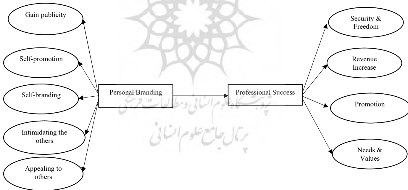
Figure 1. Conceptual model of the research based on the theoretical support of research

Studies in the field of branding may be extensive, but there are gaps in the study of personal branding, and in Iran, this issue has been less explored systematically, and in this study, it has been attempted to emphasize the fact that personal branding at a regional and local level can also be successful. For this reason, in this study, the desired location was considered as a small western city, namely Sanandaj.