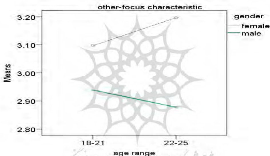
Figure 2. Plot of Significant Gender x Age Interaction on Other-focused Dimension

As displayed in Figure 2, the trend of other-focused dimension for female and male differ as a function of age range of participants. On overall, Females endorsed more than males the dimension of other focused, both 18-21 and 22-25 age ranges. As you see, the trend of other-focused dimension was different for males versus females in two different age ranges. So that for females other-focused increase by age, while in the male other-focused decrease by age.