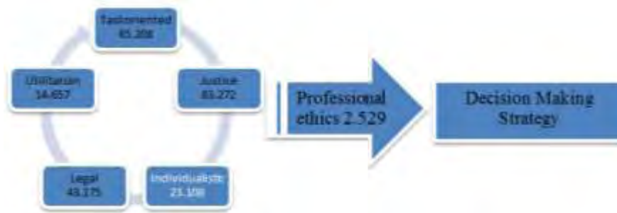
Fig. 3. Results of SEM fitness and the absolute t-values of paths