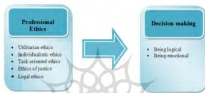
Fig 1. Conceptual model

selected as the sample using stratified random sampling method. The tools used in this study include 37-item professional ethics questionnaire which measures components such as utilitarian ethics, individualistic ethics, Task oriented ethics, ethics of justice and legal ethics, and Elaydi decision-making strategy inventory containing 18 items and two components (being logical or emotional). A Likert-type scale is used in this inventory and reliability of the above questionnaires is shown in table 1.