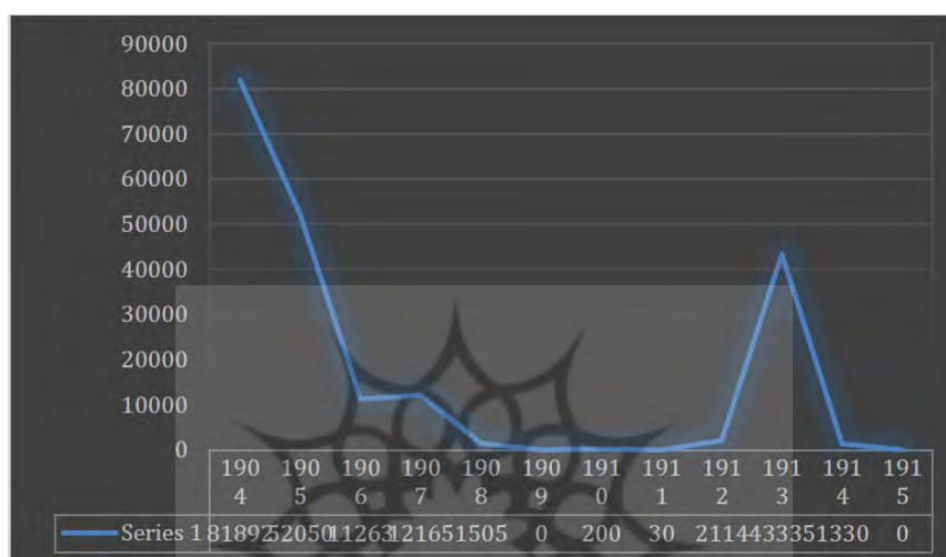
Diagram 1: The exports of Japan to Iran from 1904-1915

Based on Table 1 and the diagram, Japan's exports to Iran were diminishing during this decade and during the First World War and the involvement of most countries in the world war, the exports of Japan to Iran came to zero.