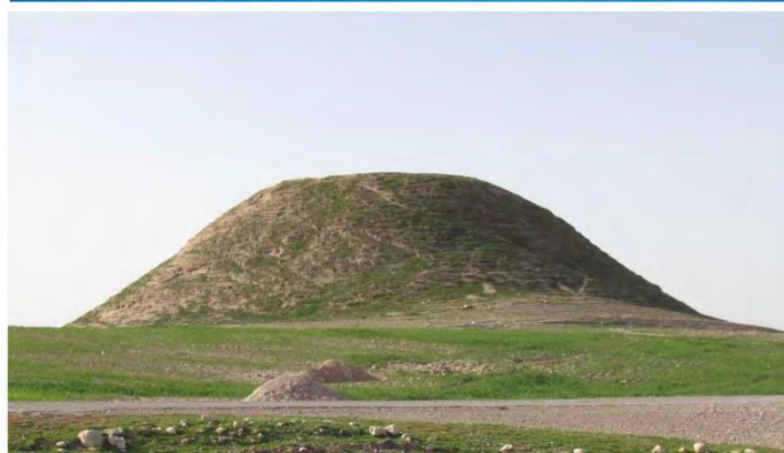
Fig. 2. Vashian, View of the Mound and its Pottery Fragments.