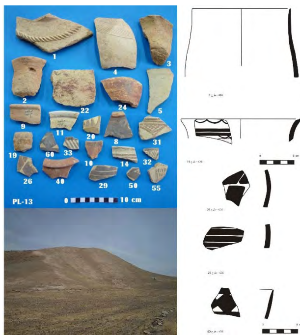
Fig. 3. Kalateh, Pottery Fragments.