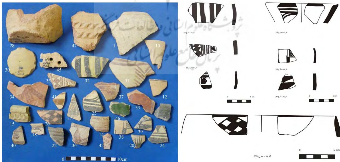
Fig. 1. Afrineh, Pottery of Different Phases of Chalcolithic Period.