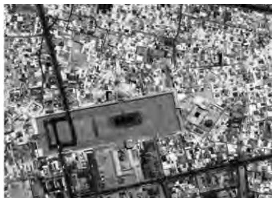
Fig 3 Naghshe-e-Jahan square, Shah Mosque plan on the right and urban texture of environs square.

The chief architect of this colossal task of urban planning was Shaykh Bahai (Baha' ad-Din al-'Amili), who focused on two key features of Shah Abbas's master plan: the Chahar Bagh avenue flanked either side by all the prominent institutions of the city, such as the residences of all foreign dignitaries and the Naqsh-e Jahan Square -"Exemplar of the World"- (Sir Roger, 1989: 172).