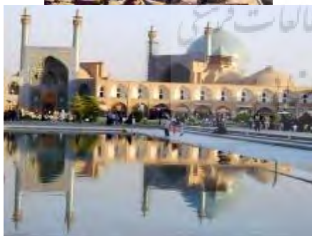
Figs 5& 6 Views of Naghsh-e-Jahan square which shows interesting design with various activities as unique example of a traditional safe and secure city. (Ref: http://www.hamshahronline.ir/imagesupload/newspose8607bazar1-zr.jpg )

Bazaar with business activities is as an important urban heart. These activities, encourage “people use the pathways” which “Jacobs” (1961) expresses as a requirement to the defensible space. Also “Angel” in his researches mentions that crime rate is related with activity scale in streets. So, felling of ownership in Naghsh-e-Jahan among shop owners which have surrounded the spaces around would lessen social responsibility. In other words, dominant social surveillance decreases crime situation and increase environmental security. Pettersson also emphasizes on “diversity of use in quarter” in order to reducing of crimes opportunity through increasing people presence (Pettersson, 1997: 179-202) and kinds of activities.