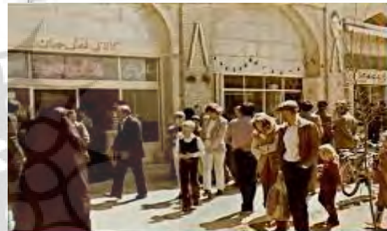
Figs 4& 5 Bazaar path and business activities beside diversity uses; recreational, religious, tourism,... around the square, give square possibility for natural surveillance and continues guarding in the old and valuable of Safavid bazaar through encouraging citizens and tourists presence.

Study on Naghshe-e-Jahan with emphasis on defensibility and environmental security of urban spaces confirm exploiting of defensible principles. One of these principles which have regarded in this historical square is diversity and efficient mix of planned uses around the square (Fig. 4, 5).