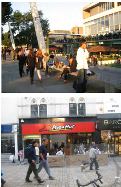
Figs 1 & 2 Increasing activity rate in street and urban public spaces, with supporting social capacity concept, encouraging passengers use and reduce of crime rate sensibility. (Ref: Rezaeifar)

In fact CPTED approach, (NICP, 2005) follows specific guidelines for reducing urban crimes (Gronland, 2000), which have paid them from preventing crime center as bellow (Pourjafar et al., 2008: 78):