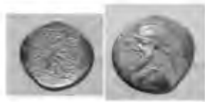
19- Mithradates I