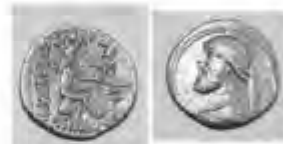
15- Mithradates I