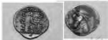
23- Mithradates I