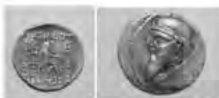
24- Mithradates I