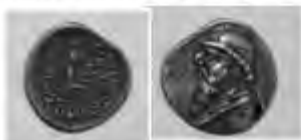
25- Mithradates I