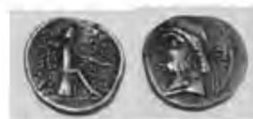
32- Phraates II