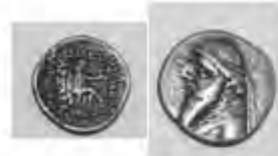
27- Mithradates I