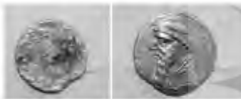
22- Mithradates I