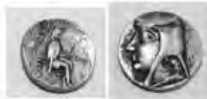
2- Arsaces II