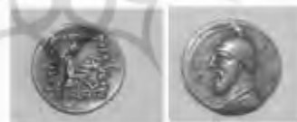
30- Mithradates I