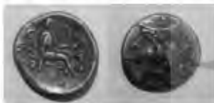
4- Mithradates I