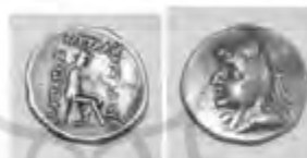
9- Mithradates I