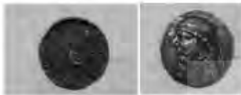
21- Mithradates I