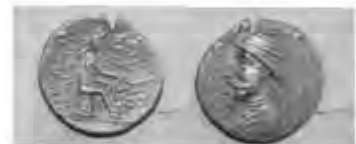
35- Artabanuse I