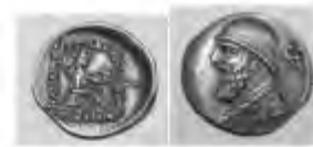
13- Mithradates I