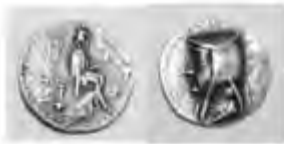
1- Arsaces II