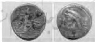
31- Phraates II