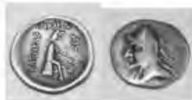
7- Mithradates I