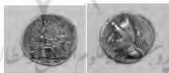
11- Mithradates I