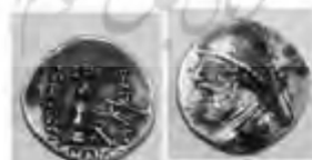
12- Mithradates I