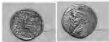
20- Mithradates I