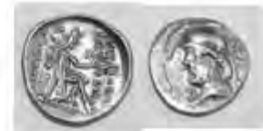
33- Phraates II