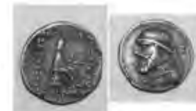
14- Mithradates I