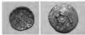
26- Mithradates I