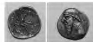
17- Mithradates I