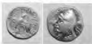
6- Mithradates I