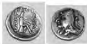
8- Mithradates I