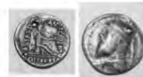
18- Mithradates I