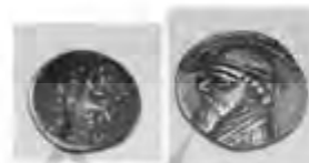
28- Mithradates I