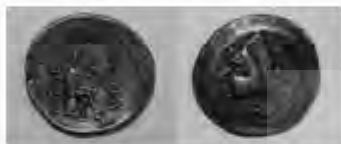
3- Mithradates I