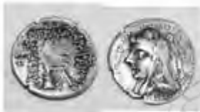
5- Mithradates I