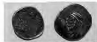
36- Artabanuse I