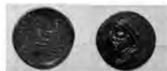
37- Artabanuse I