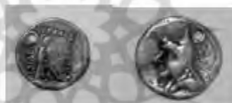
10- Mithradates I