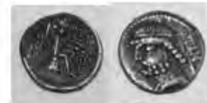
34- Phraates II