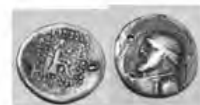
16- Mithradates I