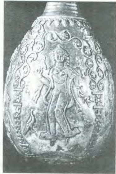
Figure 2 Silver vase showing a female holding a panther and a bird, National Museum, Tehran.

From the surviving objects of Sasanian silverwork, it seems that, after the royal figure depicted on the body of silver vessels, the numerous female figures, in dancing or walking pose, might be the next in terms of quantity. In addition, a small subset of female figures includes musicians playing the flute, guitar, or harp. The motifs are depicted on the body of a variety of vessels such as vases (Figures 1, 2), ewers (Figures 3, 4), plates (Figure 5), and bowls (Figure 6) with vase predominating. The exterior surface of the vessels, particularly in ewers and vases, is usually divided into two to four or six segments in the form of arched frames, each showing a female figure with a number of distinctive details, often holding different objects.