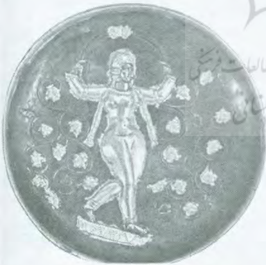
Figure 5 Silver-gilt plate showing female dancer with vegetal decoration. Cleveland Museum of Art (source: Lukonin 1971a: 181).

Harper has shown the details of the above mentioned objects in her careful iconographical study of such motifs (1971: Figures 1, 2, 3, 4); from those items some are constantly depicted in the scene and a few others such as dog, panther, and child are sometimes omitted on some vessels (Harper 1971: 505). In terms of clothing, the women appear in three forms: utterly dressed,