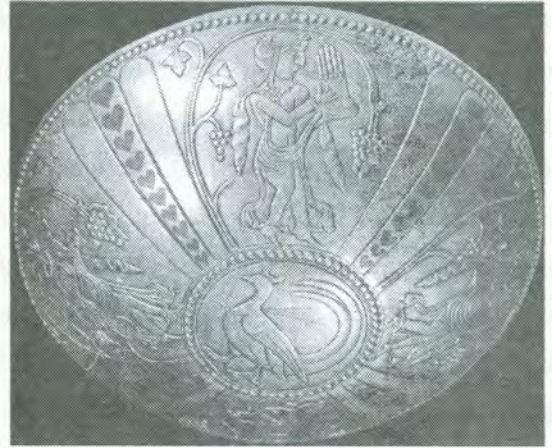
Figure 6 Silver bowl with female musician, National Museum, Tehran.

The things that women hold include either end of a shawl in each hand, with shawl forming an arch above the head (Figure 5); they are also shown while holding the hand of a small nude male child, a bird, a dog or panther and a single flower or a bunch of flowers (Figures 1, 2, 3, 4). They also sometime hold a bowl heaped with fruit (Figure 3). Considering these objects with female decoration it is said that in the reign of Shapur II, his chief priest Aturpat , by editing the text of the Avesta, “transformed the nature of the cult of Anahita, associating the goddess more closely with the worship of vegetation, of water, of flowers” (Lukonin 1971: 182).