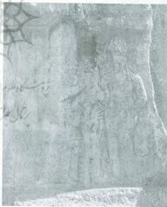
Figure 7 Investiture of Narseh, Naqsh-e Rostam (photo: Mousavi Kouhpar 2005).

period, continuing through into the Sasanian period (Shepherd 1964: 82). She also mentioned that artists from the Seleucid and Parthian periods had imitated the Greeks. Their way of rendering the female figure was used as a prototype. So, the four figures depicted on the Cleveland vase, each according to the symbols, which they hold, show different characteristics or attributes of the goddess Anahita. For instance bucket and bird are her symbols as a goddess of water; vine and flower her symbols as goddess of vegetation; the dog is her symbol as guardian of home and flocks; the bowl of fruit is her symbol as goddess of agriculture; and the child and pomegranate her symbols as goddess of fertility (Shepherd 1964: 84).