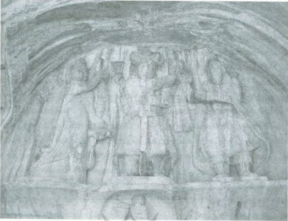
Figure 8 The investiture of Khusro II, Taq-i-Bustan.