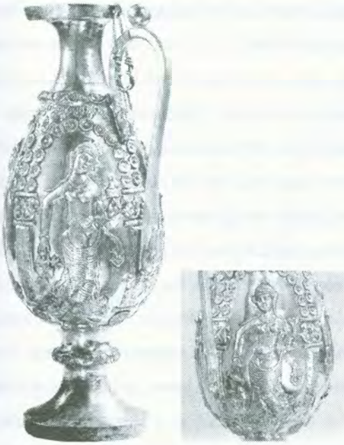
Figure 4 Silver-gilt ewer with female figure (right) holding a ewer in her hand, Metropolitan Museum of Art (source: Harper 1978: 18).