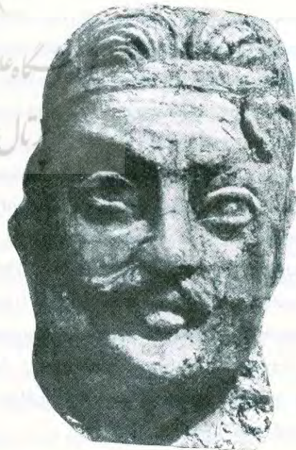
Figure 3 Two Kalachyan sculpture (Kushana period)

Downloaded from eijh.modares.ac.ir at 11:16 IRDT on Monday August 31st 2020