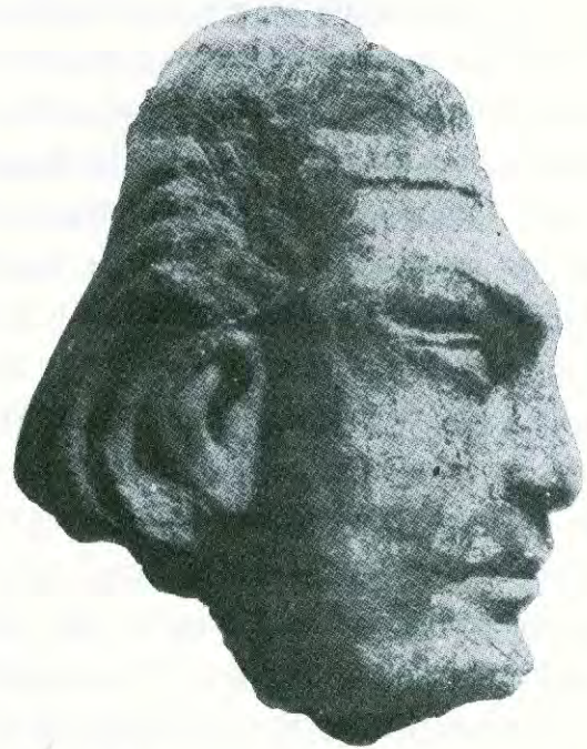
Figure 2 Obverse of silver coins maois (Kushana king)

Many Indian scholars maintain that the Romans were in touch with Kushana through the sea routes, and due to religious and social affairs of traders they had issued coins with Roman deities and Roman king. This motion seems to be unacceptable. The Roman deities must have been part of the religious life and naturally traders must