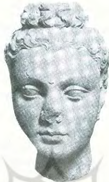
Figure 4 Budha in Gandhara

But it is needed to conduct more investigation about the traces of these people, the deities worshipped and accepted by the local people. They had religious relations with them when the Parthian had exiled them. With the passage of time, the same people became partners in commerce (Figure 4) and trade in the Kushana period.