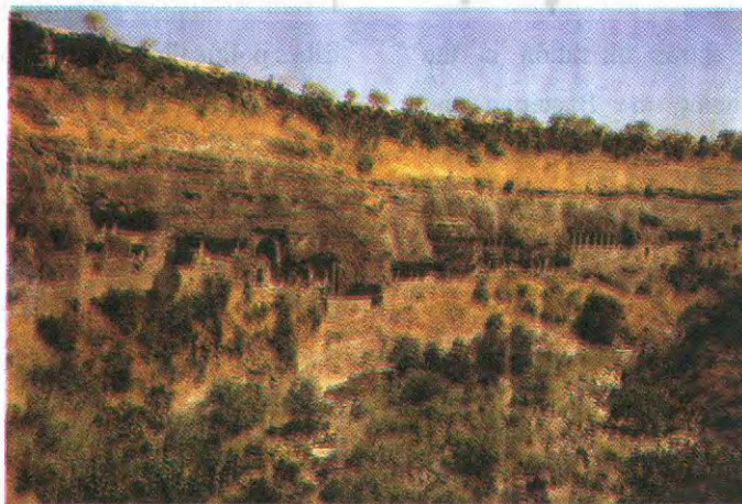
Figure 5 Persian Ambassador in Chalukyan court (Ajanta caves)

jewelry. This donation to the monks shows that it was not from land properties, rather they obtained the wealth from the merchant donation or even participating in well commercial activities and trades in the great Kushana period. They patronized Buddhism (Figure 5) just as they did for other religions.