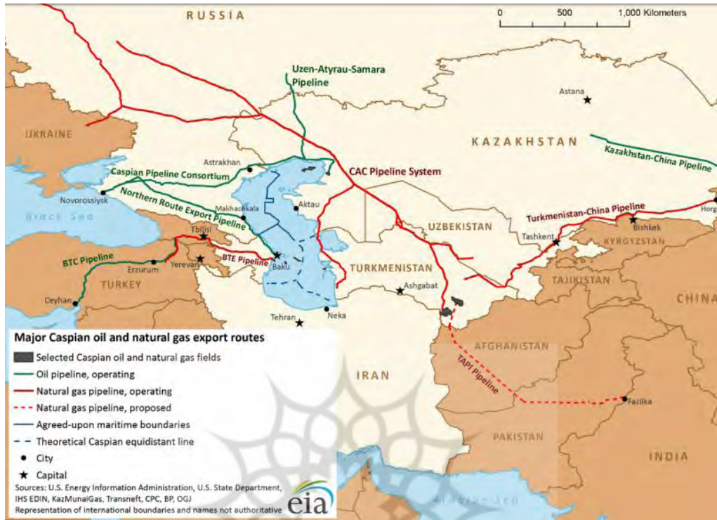
Fig 2: Caspian Basin Pipeline Map Source: (Overview of oil and natural gas in the Caspian Sea region, 2013)

great importance in oil and natural gas supply and energy geopolitics of both European and Asian markets.