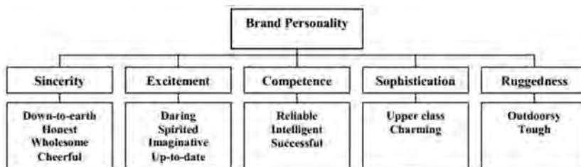
Figure 1. Dimensions of brand personality (Aaker, 1997)