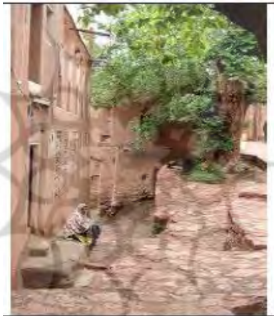
Figure 7- making the spatial common threshold between city and building.

From the view point of Madanipoor (2006: 62) the tendency to make magnificent public buildings against private buildings and special attention to the urban intersection like doorway, passages, the entrance of mosques, schools, bathhouse, squares, and the gateways of cities shaped a city with strong physical and social relationship and encouraged citizens to engage in social communication, generosity and hospitality, motivating the citizens to be kind and affable with strangers.