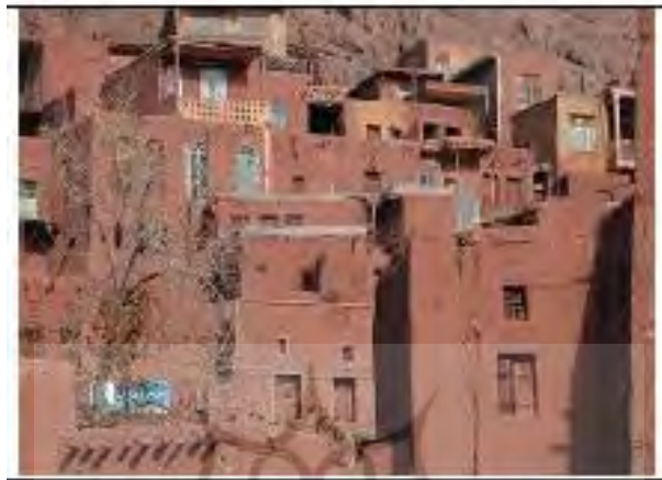
Figure 3- maintaining the comfort of the adjacent buildings in volumetric packet designing.

together as well as urban passages into the buildings is an important factor which is effective in reducing the community aversion of spaces while paying attention to the concepts of dignity and privacy.