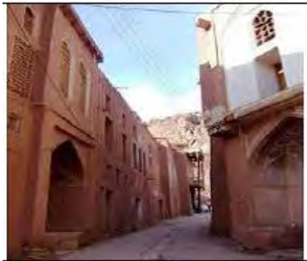
Figure 5- the utilization of secure materials in the façade overlooking to passages. Resources: the author