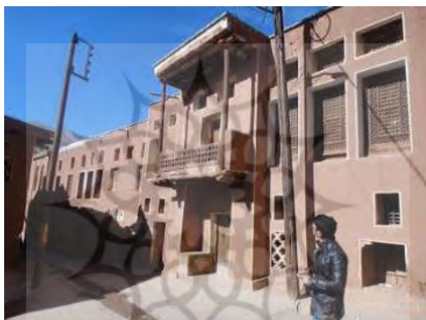
Figure 17- unity in plurality and the maximum use of materials capacity