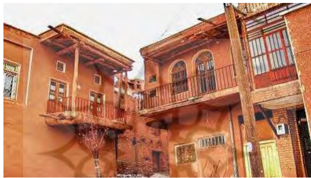
Figure 21- the effect of neighborhood units on the amount of vicinity of units. Resource: the author