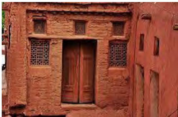
Figure 16- using the local materials and native traditional construction.