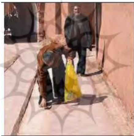
Figure 12- the adjacent fina and maintenance and looking out of urban space by people.