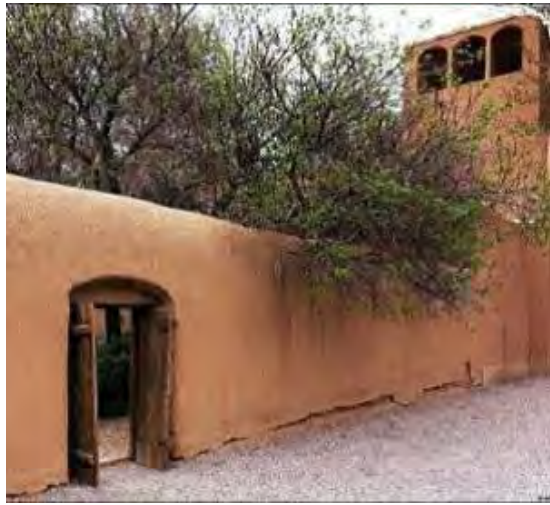
Figure 14- the landscape of architectural building in urban space