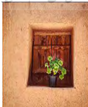
Figure 8- the sense of belonging to urban space and controlling it.