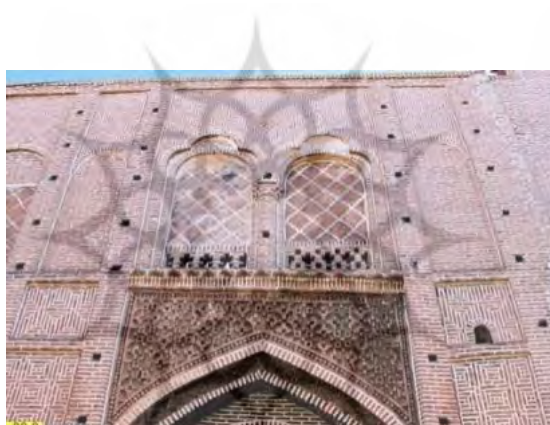
Figure 15- the visibility of texture and ornamentation based on the distance of vision