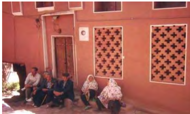
Figure 20- the definition of the entrance as the spatial common threshold.