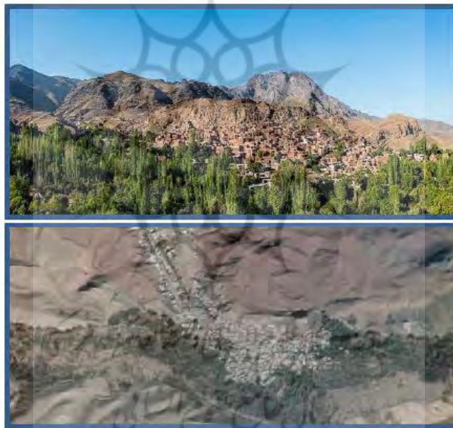
Table 11: Ranking effective dimensions on the creation of a happy city by Friedman Test

windows and often they have porches and underhung wooden balustrade overlooking the narrow and dark alleys which have created a beautiful landscape. The façade of houses is covered with red soil whose mine is adjacent to the village. People are engaged in farming, gardening and animal husbandry by traditional methods. There is no documentation to exactly specify the antiquity of Abyaneh; but it is estimated that it has a history of 1500- years old and it is known as one of the oldest human habitats on the edge of the desert of Iran. The monuments of Abyaneh date back to the Sassanid, Seljuk, Safavid and Qajar periods which indicate the antiquity of this habitat.