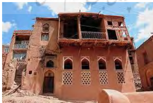
Figure 13- the intended application of ornamentation for eliminating the limitation of structure and materials.