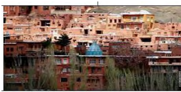
Figure 9- simplicity and tendency to make the public buildings magnificent. Resource: the author