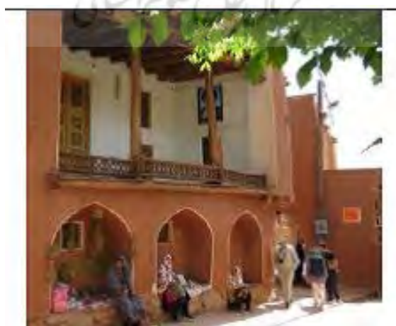
Figure 10- the participation of structure and installations in the beauty of the city. Resource: the author

The creation of various textures of a material and utilizing harmonic colors in addition to considering the climatic conditions have made the manifestation of the building different from its distance. At first, according to Gestalt rules, it represents a coherent whole and eventually by approaching to building the diversity of textures and material shows the variety of taste in the pursuit of collective identity and preserving individual integrity. The other aspect of participation in looking out the urban space, according to figure (8), is monitoring the urban spaces through openings and the look out of urban space (the eyes of the street) by people which can be referred to in the context of social participation. In these spaces, the sense of being seen and seeking for help is a desired feeling which adds to the potential of presence in the space.