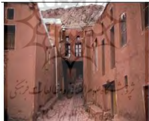
Figure 6- the arrangement of internal spaces for paying attention to the security of passage.