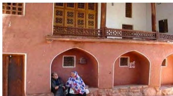
figure 19- using the elements and forms of façade as the social location. Resource: the author

According to Bahreyni and Tajbakhsh (1999: 28), in the Iranian traditional city, the religious principle of relationship with relatives plays a role to determine the urban and neighborhood districts. The urban division should be such that to make convenient the relationship between friends, acquaintances, and relatives. Home is the most secure and the most private territory for the family members and it is the place for serving guests and relatives. Platforms and porches provide the opportunity for neighbors to communicate. The main passageways and the center of the neighborhood was the territory of residents, in other words, for neighbors. The city center and the big squares were the territory of all the residents of the city. The person can easily navigate the territory in a short time and experience a familiar environment. Therefore, he has a sense of belonging to it and strives to preserve and attain the identity for his habitation. The relationship was more restricted but more friendly. The individual was acquainted with his neighbors, the family relationship and communication with neighbors were more intimate and the person was responsible for his family and his associations and he participated in their happiness or grief.