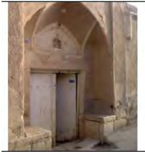
Figure 11- the allocation of architectural space to urban space (common threshold. Resource: the author)