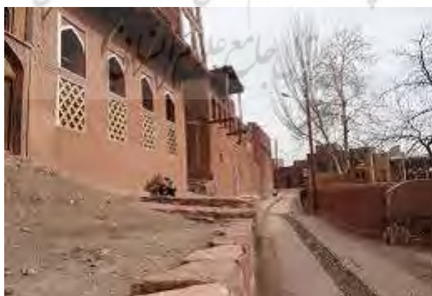
Figure 18- the emergence of life style in the form and selection of house types. Resource: the author