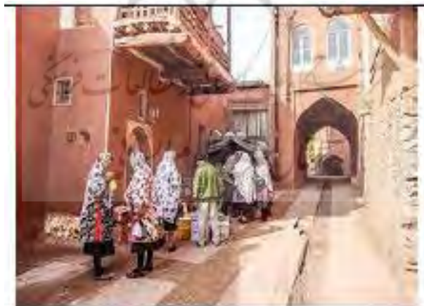
Figure 4- maintaining the comfort of passages in volumetric packet design.