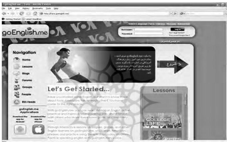
Figure 2: The homepage of VoA Special English for Persian Learners

free and can be retrieved either through the homepage of VOA or directly via their links such as http://farsi.goEnglish.me , used for Persian learners of English. This latter website includes eighty lessons broken into three levels of beginner, intermediate and advanced. The homepage of this website appears below.