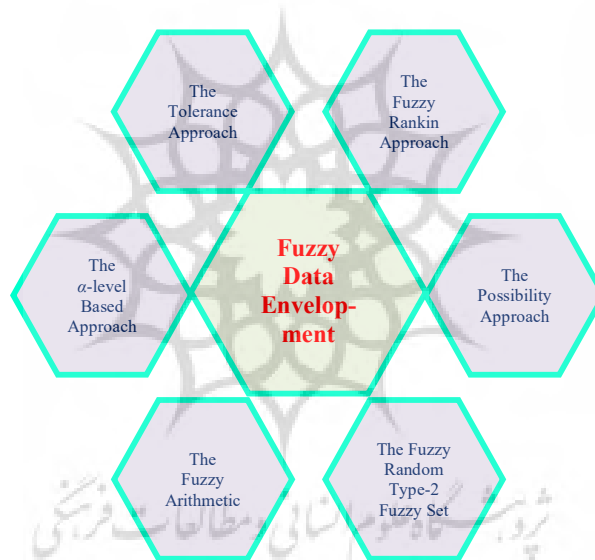
Fig. 1: The Classification of FDEA Field

After discussing about the importance of dealing with negative data, the necessity of considering the uncertainty will be discussed. In real cases, most of the times, the values of inputs and/or outputs of DEA models are tainted by uncertainty. The integration of DEA models and fuzzy set theory is one of the approaches that is regarded by researchers [12]. There are considerable researches about fuzzy data envelopment analysis (FDEA) models that are categorized by Hatami-Marbini et al. [9] and Emrouznejad et al. [4] expanding this classification into six groups, the new classification is presented in Fig. 1: