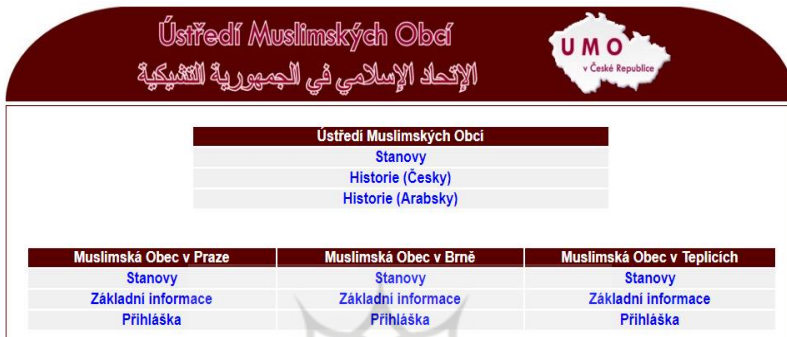
Picture 1: Center for Muslim Communities in the Czech Republic Web Page, http://www.umocr.cz/

But there is another online project connected to the Center - a web page E-islám www.e-islam.cz .