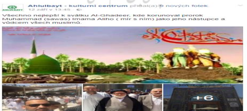
Picture 2:

According to Adday, there must be solved some organizational issues and created needed background first, then the Center can set up more activities.