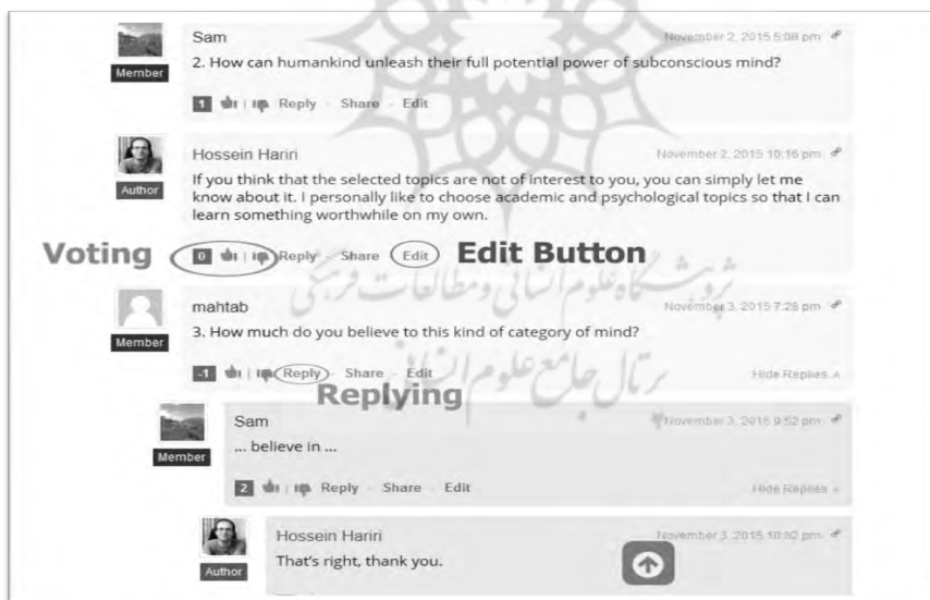
Figure 1: Asynchronous interactivity in the form of commenting, editing, replying and voting in our comment forms prior to any round table

Figure 1 is aimed at illustrating the participants’ asynchronous collaborative activities in our round tables. As illustrated below, through commenting, posting, replying, thumbing up/down other comments (peer-assessment) and even editing their own comments (self-assessment), the participants can engage in enlightened negotiation of meaning in a CBI approach, which per se might lead to the establishment of social presence.