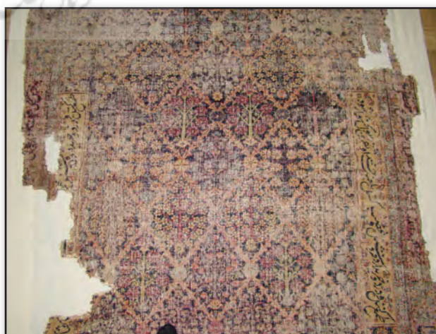
Fig. 3. The dedicated carpet context.