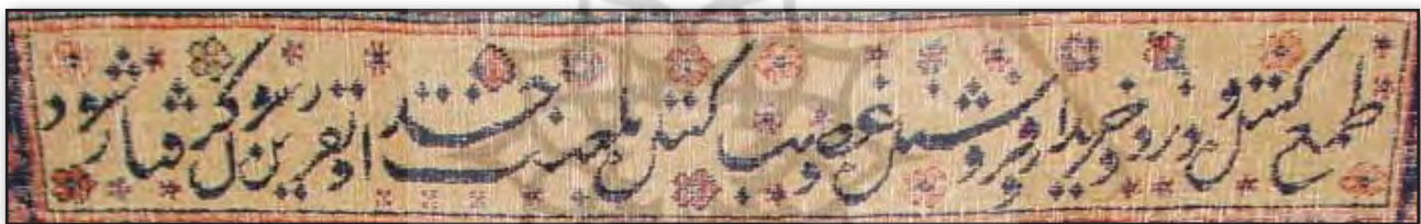
Fig. 4. Inscriptions of four peripheral frames of the carpet.

opposes any negative thoughts about the carpet so that the offender will be reminded of the warning and finds no justification for its law-infringing act. Explicit layers indicate that any greedy person thinking about stealing, buying, selling or usurping the property will suffer the curse of Allah and His Messenger. The word dedication or endowment means conservation and keeping of an exact belongings to be used in will of God. Therefore, these belongings have no owner in the material world and no person has the right to buy, sell, steal or possess the property under any circumstance. The location where the message is inserted is in form of four rectangles on the four peripheral frames of the carpet context. These frames are located on the underlying diamond network and have infringed the independence of the carpet background. This arrangement is designed to emphasize on the significance of written texts and convey the message to all addressees since