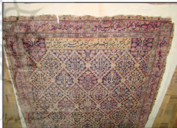
Fig. 2. The context of dedicated carpet.