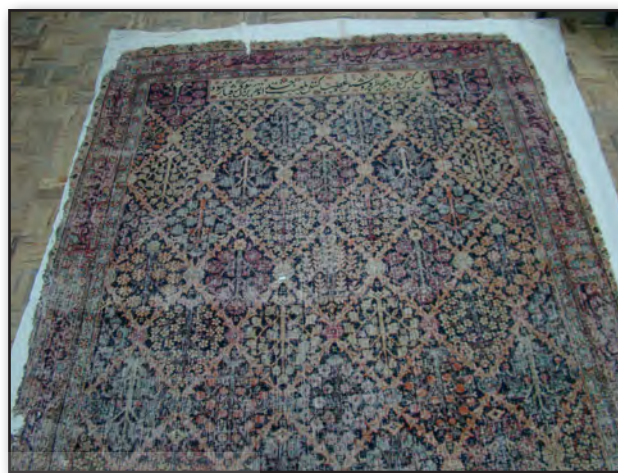
Fig. 1. The context of the dedicated carpet.

Message analysis: The message content is instructive and the carpet has been dedicated. Having a legal and warning content, this carpet addresses the public and