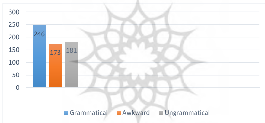
Figure 2. The number of times the shifted word order was considered grammatical, awkward or ungrammatical by all of the participants

Figure 2 shows the number of times the shifted word order was perceived as grammatical, awkward or ungrammatical by all of the participants in experiment 2. There were 30 participants and 20 experimental items. Therefore, there were 600 answers ( 30 \times 20 = 600 ).