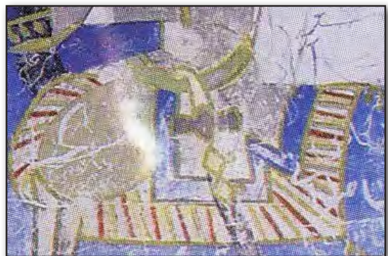
Figs. 7&8. saddle drawing of Hazrat-e Ghasem & Hazrat-e Aliakbar with similarity. Photo: Minoo Khakpour, 2007.