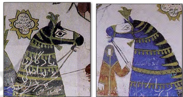
Fig. 5&6. Head drawing of Hazrat-e Ghasem & Hazrat-e Aliakbar’s horses. Photo: Minoo Khakpour, 2007.

With a view to the necessity of analysis of the contents and the comparative study of the two wall drawings of the shrine of Pinchah village, it is necessary to mention the specifications of the two wall drawings as follows: In these wall drawings in spite of not using shade, perspective and special lighting depth is only based on