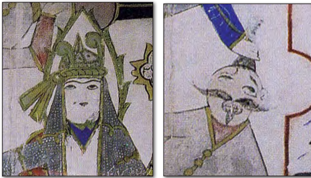
Figs. 9&10. Face drawing of Hazrat-e Ghasem & son of arzagh shami with details.