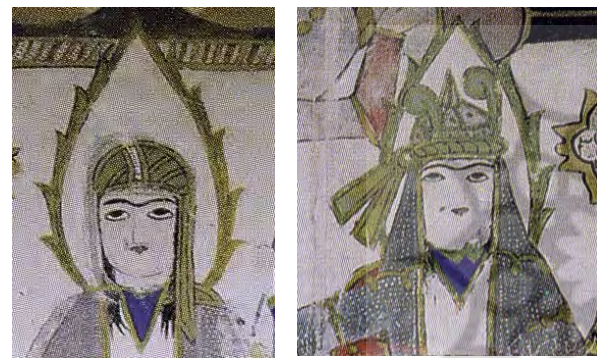
Figs. 3&4. Face drawing of Hazrat-e Ghasem & Hazrat-e Aliakbar with similarity.

saddles and the laces of the horses have been compared and as it is observed the shapes and colors of the two saddles are very similar. (Figs.7 & 8).