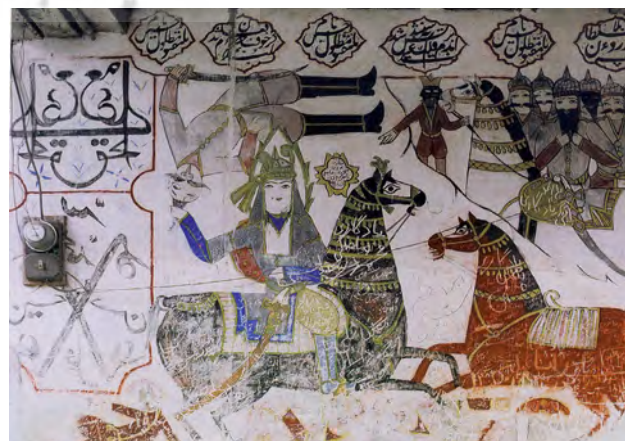
Fig.1. wall drawing of Hazrat-e Ghasem with purpose of war. Photo: Minoos Khakpour, 2007.

In the drawings the horses have similar decorations and laces and except in color there is no difference between them. In both images the drawer's seal is on the horseman and the horse's head, which is generally attended by the spectators. (Figs. 5 & 6). In the two following images, the