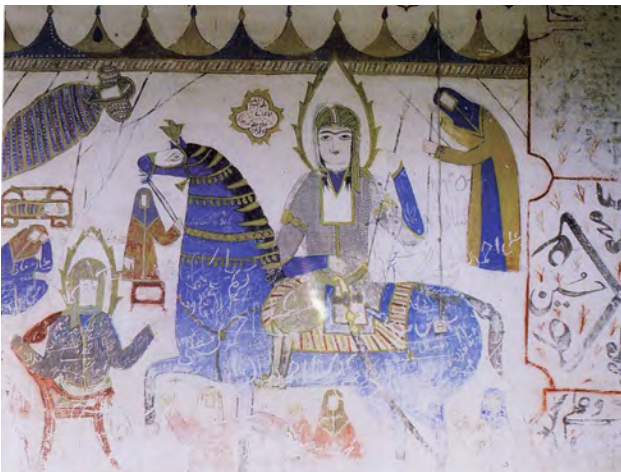
Fig.2.wall drawing of Hazrat-e Aliakbar with purpose of family. Photo: Minoo Khakpour, 2007.