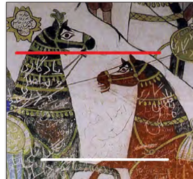
Fig. 11. comparing between horses. Photo: Minoo Khakpour, 2007.

the importance of the individuals of the story. No one of the good and evil creatures enjoy anatomical proportions and exaggeration in drawing and also painting for excitement of religious emotions is common in such a way that the drawer for drawing the holy faces insists on existence of their extraordinary force arising from public belief. The drawer believes that beautiful painting of good personalities and ugly painting of evil personalities and exaggeration in this contradiction creates visual movement and helps in