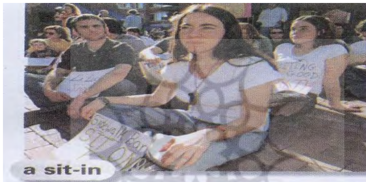
Figure 6: Interchange student s book 3 (Richards, 2005, p. Interchange 7).

As can be seen, in Figure 6, the three prominent participants (the two women and the man who are shown in a sit-in, according to the caption) are arranged in a symmetrical position: their orientation towards the vertical/horizontal axes and their distance from each other are almost similar. Therefore, all the three participants are subordinates of a classificational process in which protesters is the superordinate which can be inferred by the viewer with respect to the caption. This shows that the three conspicuous represented participants, regardless of their gender, are portrayed as part of a united group.