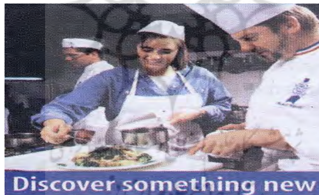
Figure 4: Interchange Student s Book 2 (Richards, 2005, p. 30).

As is shown in Figure 4, the frontal plane of the woman in this figure is parallel to the frontal plane of the viewer. She is, thus, depicted as someone who belongs to the viewer's world or someone with whom the viewer is involved. The male participants, however, are shown from an oblique angle. They are, thus, represented as others, as detached from the viewer. They are,