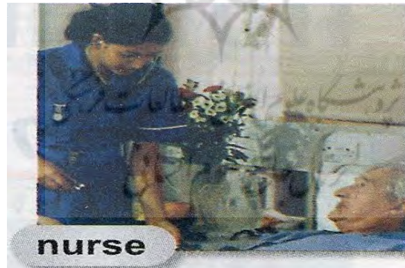
Figure 1: Interchange Student s Book 1 (Richards, 2005, p. 15).