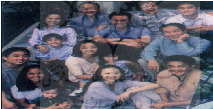
Figure 2: Interchange Student's Book 1 (Richards, 2005, p. Interchange 5).

According to the title of the relevant exercise in the textbook, Figure 2 depicts the members of a family who constitute the represented participants of this image. With respect to the female participants, vectors are formed by the arms of five women; thus, there are five action processes identified in this picture.