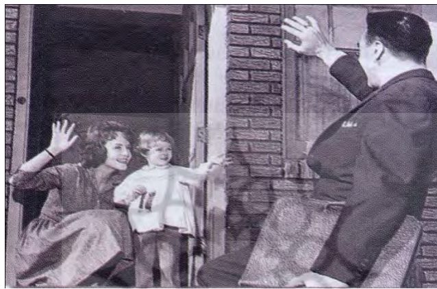
Figure 7: Interchange Student s Book 2 (Richards, 2005, p. 14).

The two female participants in Figure 7 are, on the one hand, separated from the man by the framelines formed by the right edge of the door and, on the other hand, they are represented as belonging to the context of home because they are positioned within the frame formed by the edges of the door and also the dark shade behind them. In fact, the edges of the door and the dark part within the frame of the door divide the picture into two parts: home and outside . The man is depicted as belonging to outside (activities) while the females are shown as belonging to home; these representations also seem to be stereotypical.