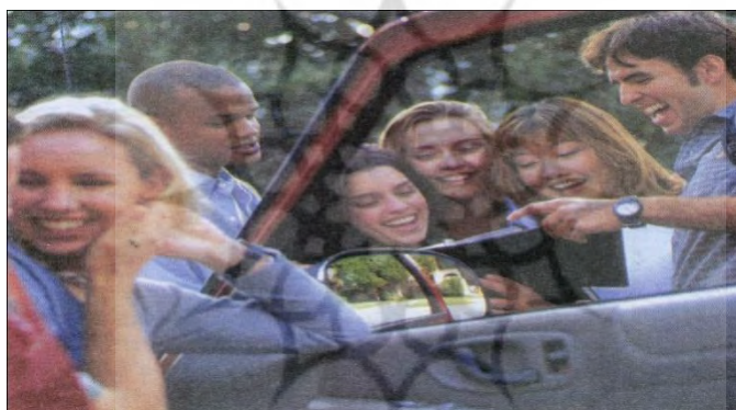
Figure 5: Interchange Student's Book 3 (Richards, 2005, p. 73).

As is seen in Figure 5, the three women placed between the two men are arranged in a symmetrical fashion because their size, their distance from each other and their orientation towards the vertical/horizontal axes are similar. Therefore, they are depicted as equal to and subordinates of a classificational process in which the superordinate is female friends . The structure of this classificational process is a covert taxonomy because the superordinate is not explicitly mentioned or written on the image, but rather it can be inferred from the symmetrical composition of the participants. The two men are also placed in a symmetrical composition with respect to each other: their size and distance from female participants are almost equal and their orientation towards the vertical/horizontal axes is symmetrical. Thus,