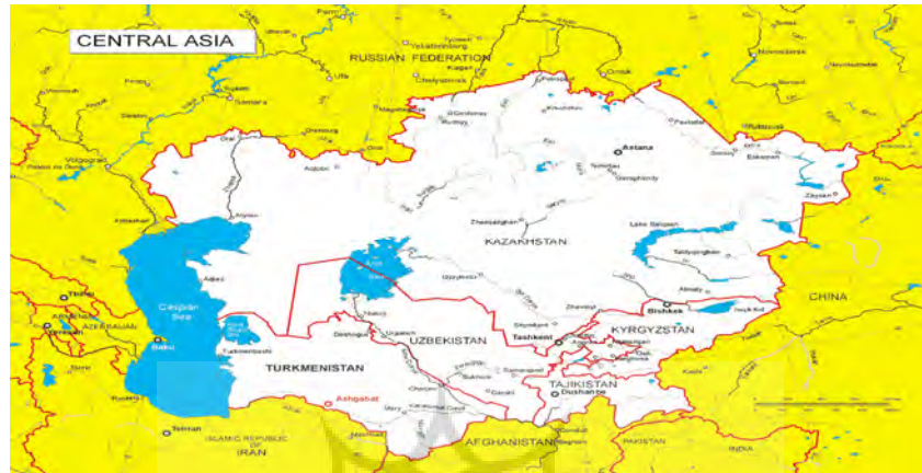
Map 1. Political map of Central Asia 1