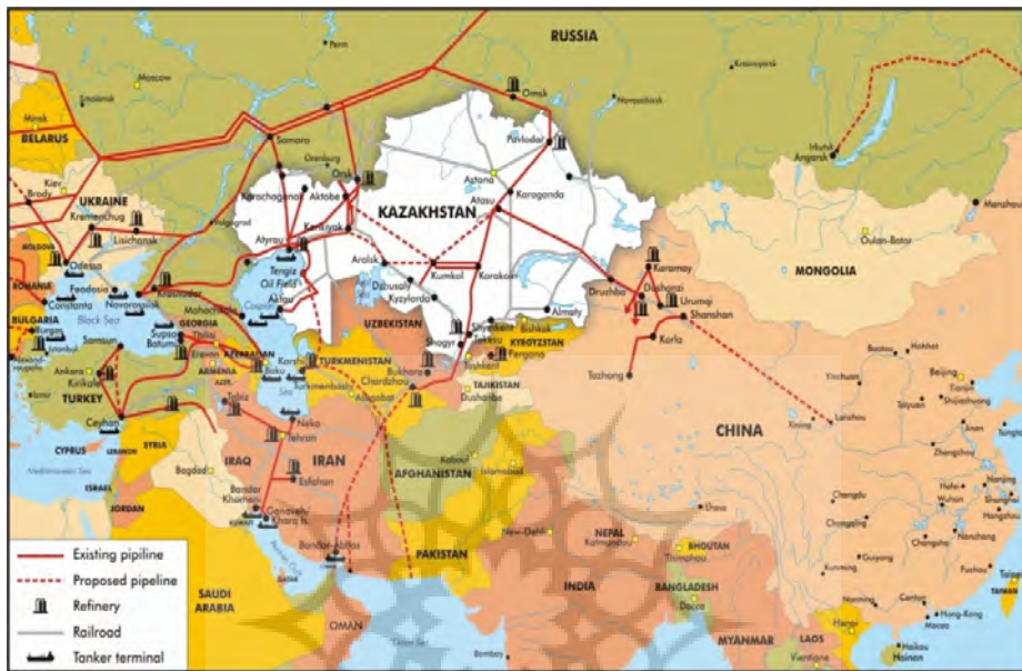
Figure 2. Central Asia's energy transmission routs 1