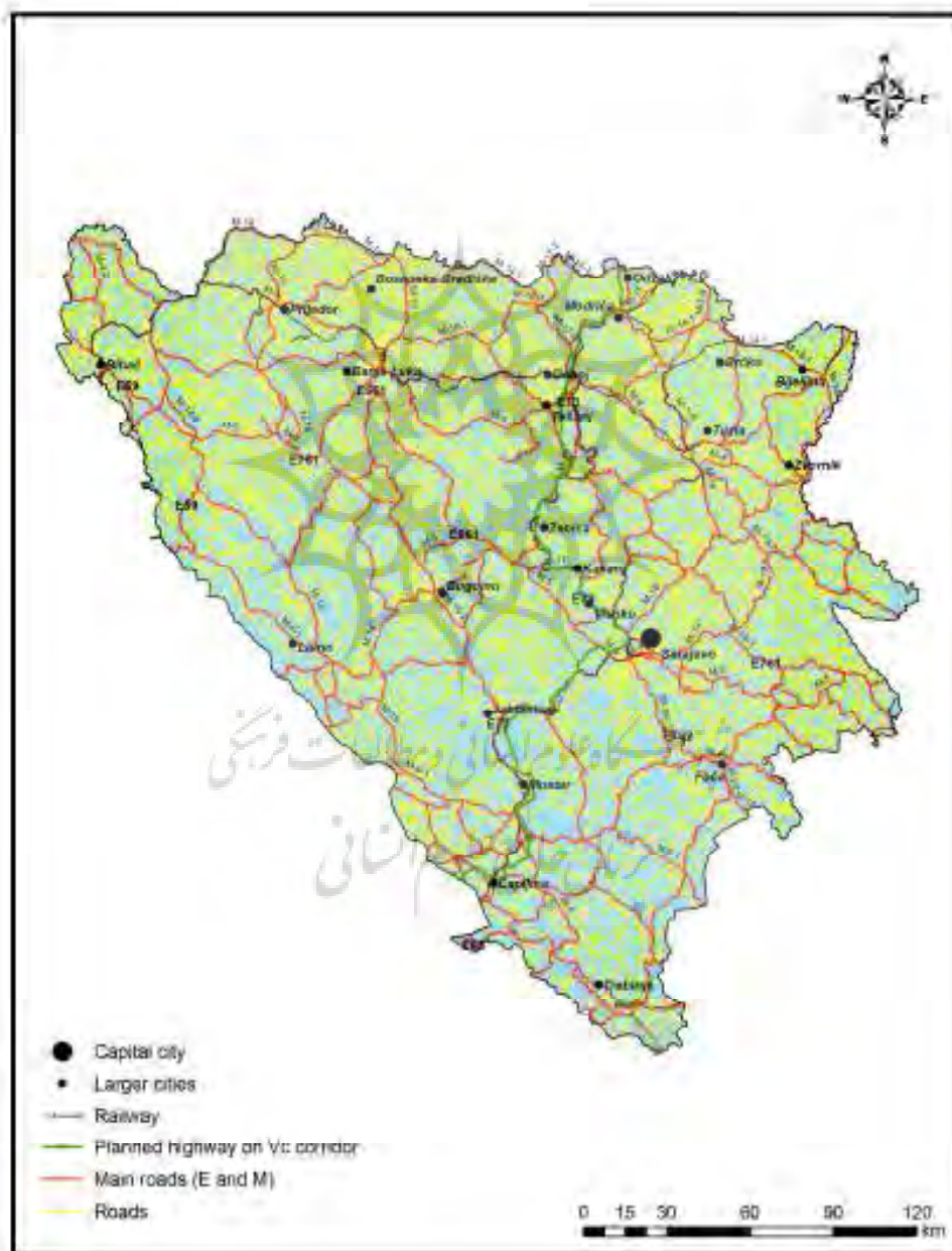
Figure 2. Road network in Bosnia and Herzegovina, 2013

so that they often surmount a series of mountain curves. For this reason, on larger part of these sections transport conditions are not in accordance with a class of roads, transport volume and structure, which reflects unfavourably on economy and safety of transport (Nurković, 2008).