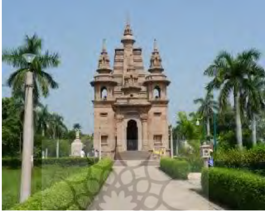
dehgahi.blogfa.com بنارس شهر ادیان ہندی