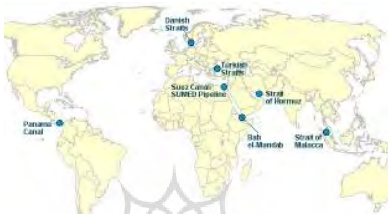
Figure 1: World Chokepoints