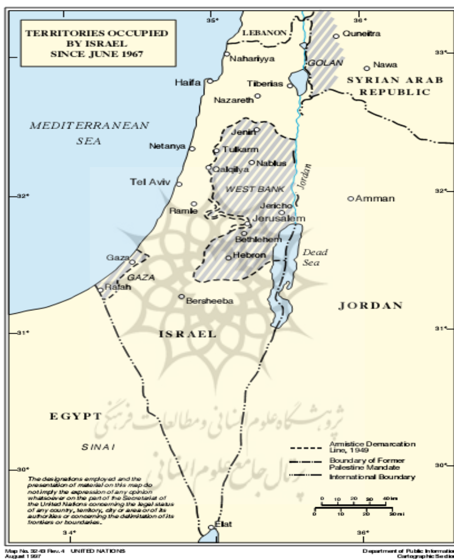
Figure 2: Territories Occupied By Israel since June 1967 .( United Nations, 1990.Chapter 3.)

Egypt and Jordan accepted resolution 242 (1967) and considered Israeli withdrawal from all territories occupied in the 1967 war as a precondition to negotiations. Israel, which also accepted the resolution, stated that the questions of withdrawal and refugees could be settled only through direct