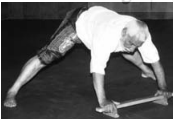
Figure 14. Easiest form of Shena.