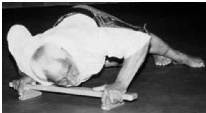
Figure 16. Push-up with twist for muscular endurance and flexibility.

4-Narmesh (calisthenics): - After the relatively long and tiring Shena exercises, there comes a period for stretching and different calisthenics movements. The purpose of this part of the session is to relax all the muscles by stretching and shaking them before going into another heavy exercise.