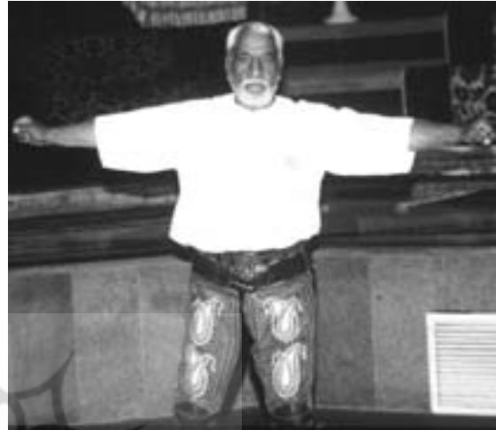
Figure 18. Starting position for Charkhidan

In many instances, the athlete will spin so fast that the Morshed can't keep pace with his speed. This exercise is designed to increase the athlete's agility and balance and to decrease the lean body mass, also, cure dizziness and jaundice and to increase the ability of the body for a better blood flow. Charkhidan, similar to Shena and Meel exercises has various forms that are selected, specializes in and performed by the athlete individually. To stop the rotation exercise, the athlete slows down gradually before stopping completely. Then, regains his original place in the Gowod (see Figure 18).