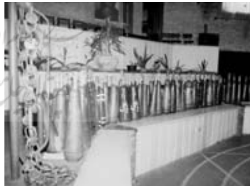
Figure 10. Meels by the Goweh, ready to be used by the athletes.

16-Kabbadeh: Is a bow shaped iron instrument used for weight training in Varzesh-e-Bastani. On this instrument, the string has been replaced by a heavy chain which generally is made of 16 links. Each link is about 12cm. long and 5cm. wide. In each link there are approximately six metallic discs, each one measuring about the size of a small saucer. The chain is about 65cm. longer than the bow itself, which is about one meter long. Kabbadehs weigh mostly between 11 to 50kg (Haim, 1958). This weight can be adjusted to athlete's ability by removing or adding chain links or discs (see Figure 11).