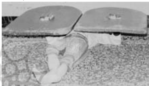
Figure 22. Starting position for Sang exercise with the Sangs lifted at horizontal position

In this position the athlete grips the handle of the Sangs, which are held already by two helpers for each one. When the athlete is ready he lifts the Sangs off the floor, at arm length (see figure 21) or flexed arms (see Figure 22) to take the starting position. From this position the athlete begins to rotate on his back from right to left and back from left to right alternately. Every time the athlete turns on one side he stretches his opposite arm straight out in order to lift the Sang as high as possible in the air (see figure 23). The Morshed counts the number of times that the athlete carries the Sang across the body to help him to keep track of gradual progress