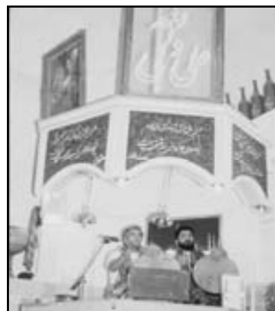
Figure 3. Two morsheds directing the practice session.