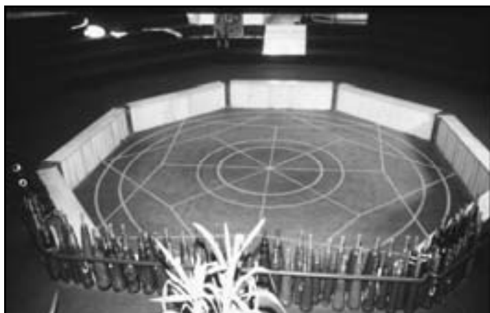
Figure 2. Gowd, the lines on the floor are ornamental.

5-Gowd: Is the most significant facility where all the activities of the Varzesh-e-Bastani are performed. The Gowd is generally an octagonal pit of about 75 to 100 cm. deep and its total surface depends on the size of the site (10 to 45 square meters). The floor of the pit is constructed with different layers of, from bottom to top, crushed tumbleweeds, a thinner cushion of dried fine straw, a thicker layer of coal ash and finally, a well packed layer of clay or argil in a way to assure softness and flexibility needed for the safety of the Bastanicars during their physical activities. The Khadem (janitor) of the Zoorkhaneh makes regularly sure that this floor is sufficiently well packed and humid before the start of every session (Ayria, 1975). To eliminate the detrimental effects of dust and humidity, especially in an indoor and relatively small space such as the Zoorkhaneh, the methods of construction of Gowd's floor are rapidly approaching the ones used in constructing the other sport activities areas like the contemporary running or playing fields (see Figure 2).