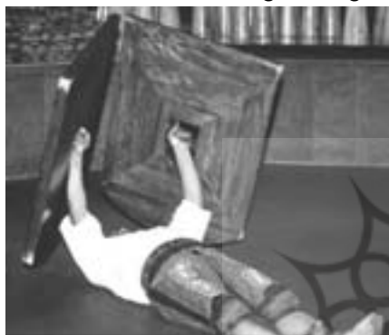
Figure 21. Starting position for Sang exercise with the Sangs lifted at arm length

10-Sang Greiftan (weight exercise): -To do this exercise the performer lies on his back on the floor with his legs straight (or crossed).