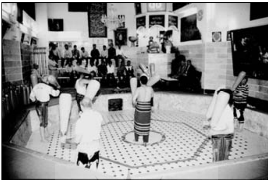
Figure 6. Miandar performing at the middle of Gowed.

11- Baladast and Paeindast: To begin the Zoorkhaneh practice session, after the drum has begun to play, the Bastanikars leave the looker area in a single line with the Miandar first and the Nochehs (see below) last in the line. All the other athletes, according to their seniority, are ranked from high to low in between. The athletes approach the Gowed in trotting and leap into it in the same order. Except the Miandar who goes directly in the center of the Gowed, the rest continue their way to the right in a slow trot until every body has come in and is positioned in a circular line, which is defined by the walls of the Gowed. In this position, which will be kept till the end of the session, every one will necessarily have an athlete on his left and another on his right. The higher status athlete, standing on the right hand side of every participant, is exactly the one who is called the Baladast. Therefore, in the hierarchy of Varzesh-e-Bastani every body has a Baladast, as well as a Paeendast (the lower status athlete, standing on his left hand side).