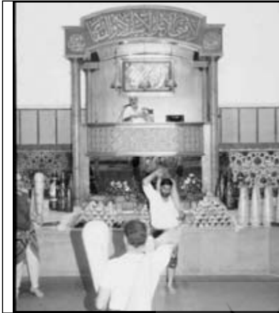
Figure 7. Sar-Dam of a Zoorkhaneh.