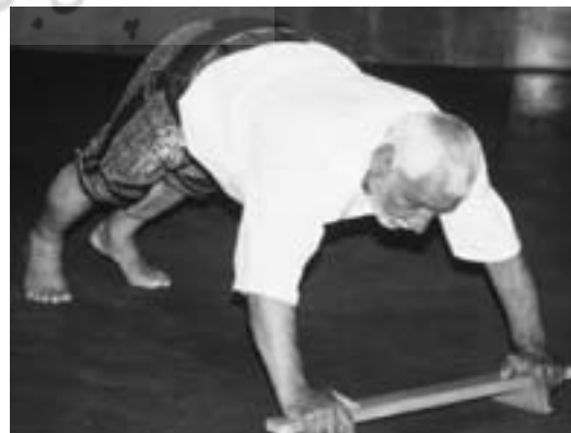
Figure 15. Ordinary push-up, a heavier form of Shena