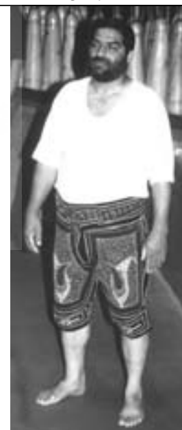
Figure 13. A Bastanikar with his Shalvar-e-Bastani.

20- Kamarband: Is a large and heavy leather belt made especially for Shalvar-e-Bastani. This belt provides a more dependable grip for wrestling specific to Varzesh-e-Bastani.