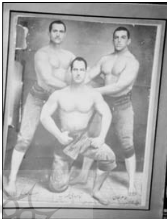
Figure 1. Pahlevans of about a century ago.

army and security of town. The significance of Pahlevanship has been well presented in the Farsi language literature. As an example, Ferdowssi, in his outstanding poetic book pictures Rostam, the Persian legendary Pahlevan, fighting heroically against depravity, vice, and sinful deeds and thoughts in the purest and most literary forms in the tenth century (Reuben, 1967). Other examples of the well-known Palevans are Ayyar and Shater who during the invasions of Arabs and Mongols struggled hardly to free the country from the foreign domination and to assure the autonomy and integration of their nation. In each Varzesh-e-Bastani session, the Morshed accompanies all the exercises with chanting the epics