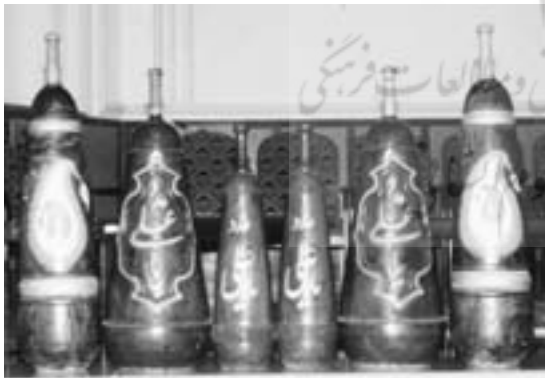
Figure 9. Different size of Meels.

15-Meel: Is a big chunk of hard and heavy wood related with the idea of using it somewhat like Indian clubs. However, it differs with them in a number of ways. First, its base is the largest part of it. Second, it is considerably longer (about 60 to 80cm.), larger (base about 20 to 30cm. in diameter) and heavier (about 12 to 40kg. pair). Third, Meels are used primarily for weight training. Fourth, one pair of Meels is necessary for exercise in Varzesh-e-Bastani. Fifth, the handle of the Meel is a cylindrical piece of hard wood about 12cm. long and 3cm. in diameter that is fixed very firmly on the top of the Meel (see Figures 9 &10).