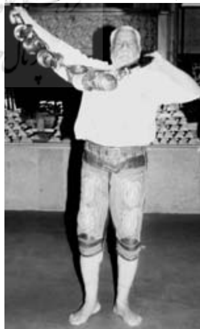
Figure 20. Kabbadeh exercise