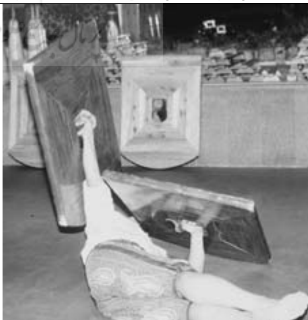
Figure 23. End of one repetition in Sang exercise

At the end of the exercise bout that the athlete feels tired he lowers the Sangs and put them in contact with the floor again. In other words, the duration of the exercise is determined by the stamina of the individual performer. Some authors have contended that for the advanced Bastanikars 50 double rotations