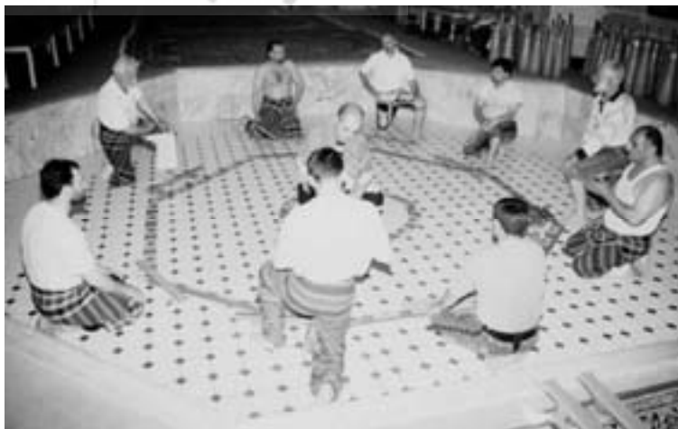
Figure 24. Position of the Bastanikars at the concluding ceremony.

technic of Zoorkhaneh massage is very simple and every Bastanikar after a few times of practical training can do it properly. It is, however, important to know that this kind of massage is even only to the upper part of the body because, in fact, they have been much more active during the whole session of physical exercises than legs. To receive the