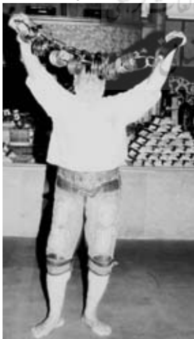
Figures 19. Starting position for Kabbadeh exercise.

9-Kabbadeh Keshidan (iron bow exercise): - This exercise is planned to increase the power and strength of the arms and shoulders by helping the torso flexibility.