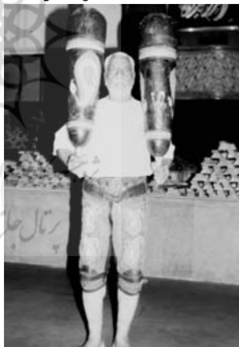
Figure 17. Meel Geireftan (club exercise).

their clubs in a ready position: upside-down and with the hands held in front of the body, waist-height, elbows held close at the sides. With second signal from the Morshed, the actual exercise with the Meels begins. The exercise, similar to the previous one, is done in different forms, from easy to heavier and more complicated in terms of the skill and the energy expenditure requirements. In this exercise, the athletes turn the Meels around their shoulders alternately and in a balance, continuous and circular fashion until the Morshed gives the top signal. This step of the session is designed primarily for strength and power training of the upper body muscles. Also, it contributes to flexibility and muscular endurance of the shoulders, arms and hands of the athletes (see Figure 17).