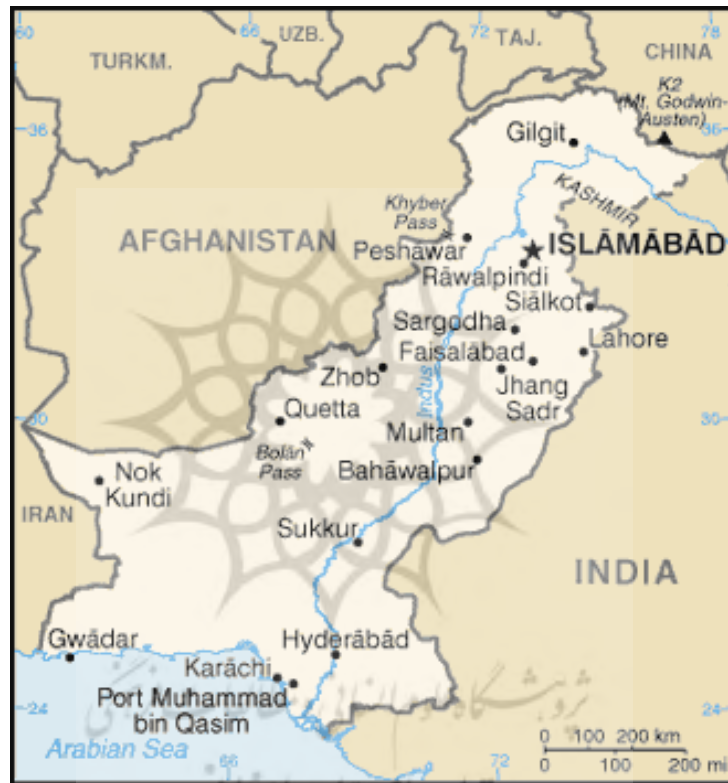
( Sindh )