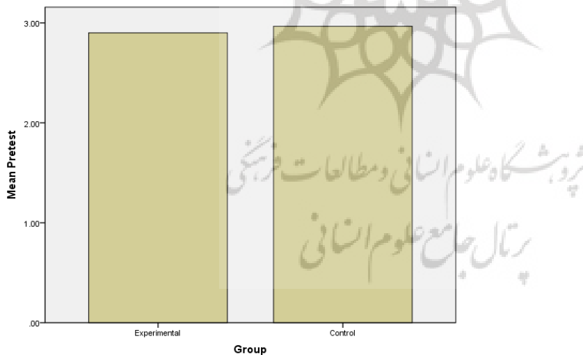
Figure1. Mean scores for pre-test