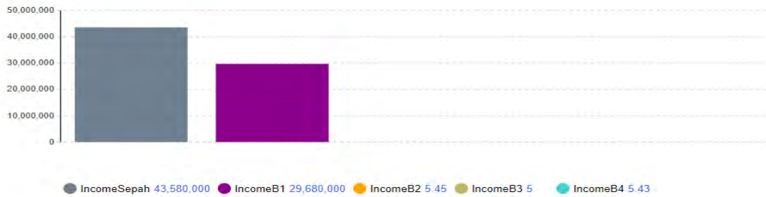
Fig. 1: First scenario: Sepah Bank only exploits and other banks only explore

First scenario: Sepah bank (case study) only exploits and other banks only explore: In this case, various situations may arise. This mode is checked: the client both serves and deposits with the possibility of irrational decision-making (0.5). Accordingly, 50% of clients decide logically, while 50% decide illogically. As it is shown the income of all the banks increases. But based on the defined scenario, the revenue of Sepah Bank and Bank 1 will further increase (Figure 1).