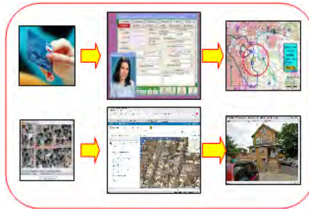
Fig. 2 sample of the progress of accessing people's location information using smart cards

hygiene data are made and given to professionals for use.