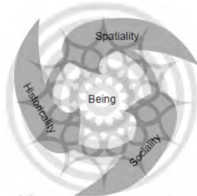
Figure 1. The three aspects of being (Gregory, D. et al. 2009: 776)

from three perspectives: history, space and social relations. History is related to time, natural and historical phenomena, and anything that points to the construction of a social formation. Spatiality is the way human groups are organized in place and it is the relationships between nature, human and his artificial world. The third dimension is related to social relationships and the dynamics of production. To Soja, studying spatiality without its historical and social dimensions is futile and results in a kind of short-sightedness regarding space. Therefore, any human geography that discusses space regardless of history and social relationships would have an inadequate perspective. Thus, Soja encourages a trialectic approach between historicity, spatiality and sociality. Humans are simultaneously historical, spatial and social. Each of these three aspects has formed in relation to the other two aspects and it is only understandable by a triangular approach.