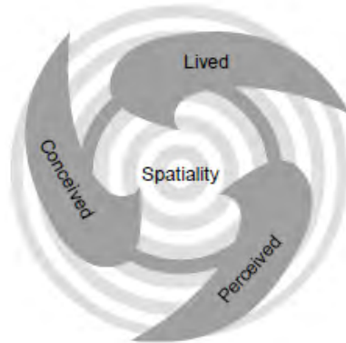
Figure 2. The trialectics of Spatiality (Gregory, et al. 2009: 776)

three aspects of spatiality cannot be understood without the other two aspects: historicity and sociality.