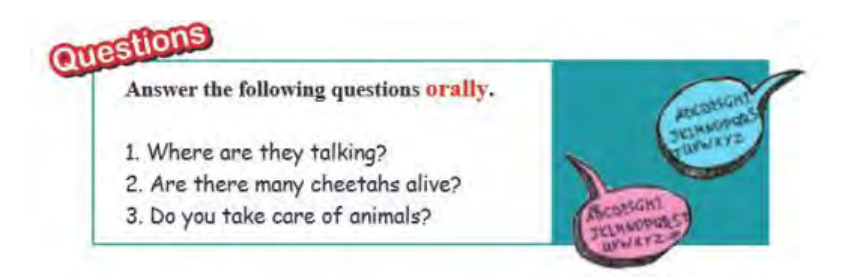
Figure 2 Activity of the conversation part in "vision 1"

The Table 5 displays the factors that influence the engagement of Iranian EFL high school students in 'Vision 1'.