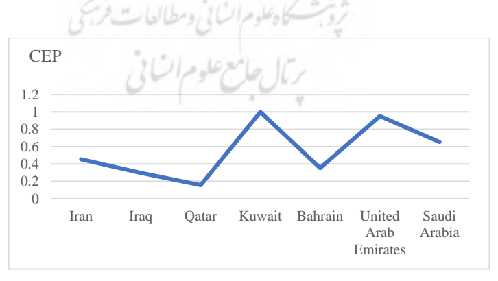
Figure 3. The EC performance of the Persian Gulf countries