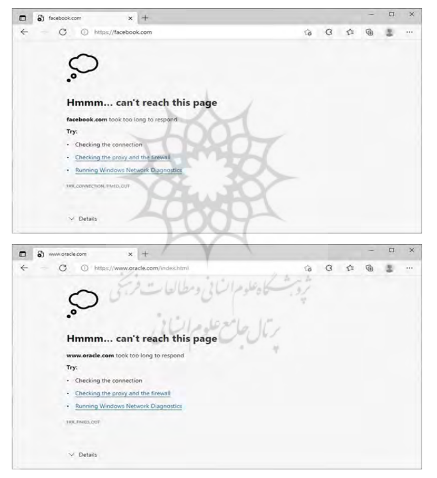
Figure 1. Similar messages shown when clients with Iranian IP addresses try to visit Facebook and Oracle websites, one of which is filtered by the Iranian government while the other one is blocked for Iranian users as a result of the United States sanctions

However, today, studies like that cannot be replicated using up-todate data. This is mainly because when access is not given to a blocked website, the old-fashioned Filtering Committee's message 'Access to the requested website is not possible' does not appear for the users as in 2013. Instead, the browser's common technical error is shown with the messages such as 'This site can't be reached' (Figure 1). Therefore, we are not able to distinguish the exact cause of unreachability anymore. Moreover, in some cases, lack of access may be caused by the U.S. increasing sanctions as a result of which webpage owners have blocked access for clients with Iranian IP addresses (Figures 2, 3).