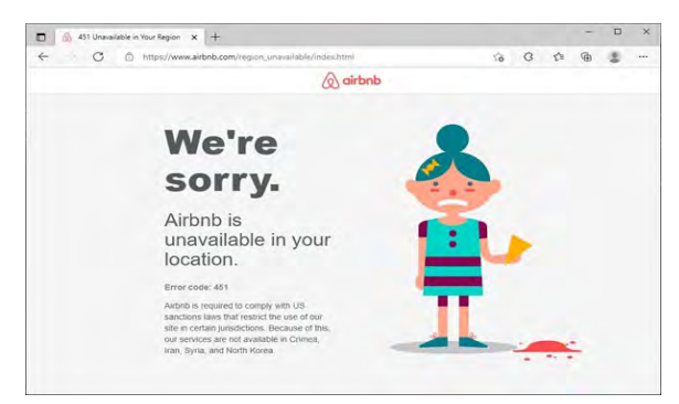
Figure 3. A screenshot of the message shown to Iranian users when they try to visit the Airbnb website (We're sorry. Airbnb is unavailable in your location. Airbnb is required to comply with US sanctions laws that restrict the use of our site in certain jurisdictions. Because of this, our services are not available in Crimea, Iran, Syria, and North Korea)

Thus, instead of updating the reachability status of the world's top websites, we decided to present the latest state of access to the world's top mobile applications in Iran. This approach has a number of attractive features: Firstly, today, mobile apps are increasingly replacing websites. Second, in contrast to the filtered websites for which there isn't any official list, the status of filtered applications can be publicly checked through the Iranian app stores which are required to comply with the Filtering Committee's decisions. In addition, by expanding the study area to Google Play Store, we also managed to document the apps restricting access to their services for Iranian users as a consequence of the U.S. sanctions (Figure 4).