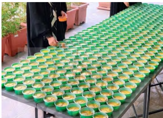
Figure 8. Planned humanitarian actions

M. S. stated regarding micro-celebrities' humanitarian activities: "we cooked sholezard (an Iranian traditional desert). I think there were at least 1000 bowls of sholezard. It was supposed to start pouring and distributing them from 12 o'clock. N. D. said – let's gather 500 bowls and arrange them beautifully so that I can take a good photo. We insisted that people were waiting, and the desert would cool down; however, it was useless. Our work was delayed for almost two hours as she took images from various angles for her stories and posts."