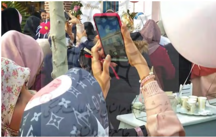
Figure 3. Practical rules 1

"the other time that I had been invited to their birthday party everybody was holding a cell phone, and no one put them down. The poor child whose birthday was being celebrated did not understand anything at all from noise. Honestly, even adults like me were bored among all those influencers as everybody was sharing stories."