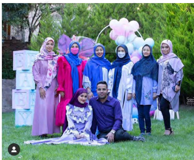
Figure 2. The present participants