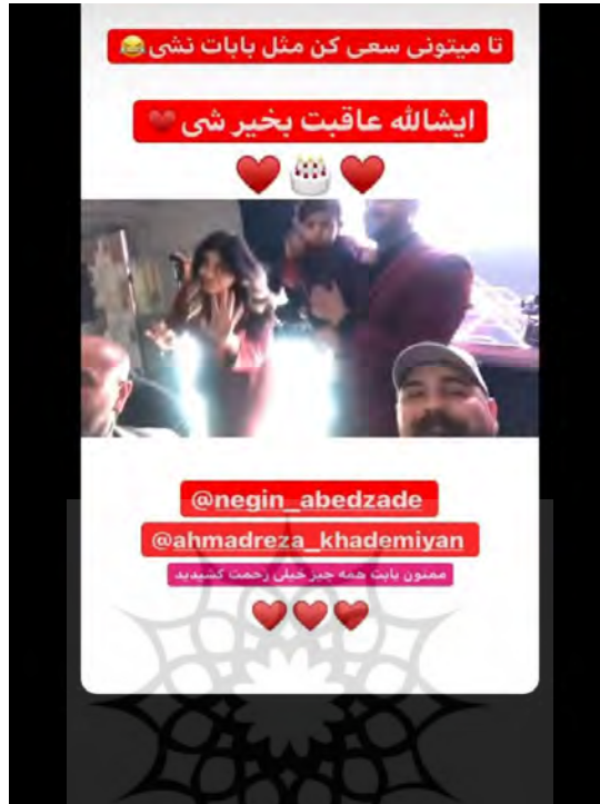
Figure 4. Practical events

collared interpretations of how their maker or makers perceived and reconstructed the reality (Serafinelli, 2018: 41).