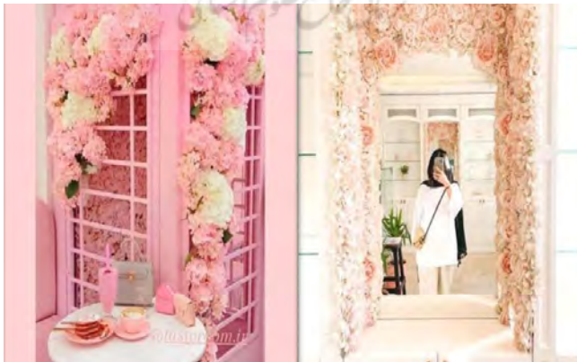
Figure 9. Location 2

As Sarah Frier, reporter of Bloomberg, said in "No filter: the inside story of Instagram": "after the graphic revolution and the emergence of Instagram, many businesses and various environments changed the manner of designing spaces and marketing their products to adjust them to the requirements of establishing visual relationships and making them fit to be displayed on Instagram (Frier, 2020).