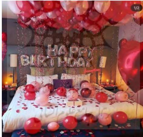
Figure 6. Luxury in the form of implementation

As mentioned before, Veblen considered basis of people's dignity to portrayal of wealth to conspicuous consumption and leisure. Z. A. and M. Sh. are so mentioned the types of luxury gifts and their conspicuous nature in pseudo-events of micro- celebrities.