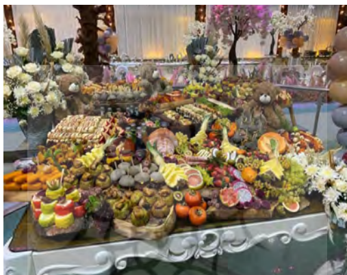
Figure 7. Luxury in the form of presentation, the types of refreshments

"In general, the gifts were very luxurious and expensive, particularly the gifts that an influencer give to other influencers. That is because they know the images will be shared via stores. Thus, at least the box, its size, particularly the price of the gift is very important."