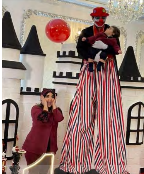
Figure 5. Form of implementation, staged