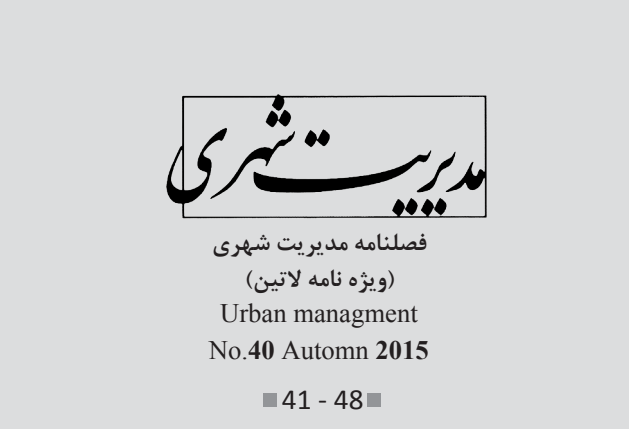
Received 23 Sep 2014; Accepted 11 Mar 2015