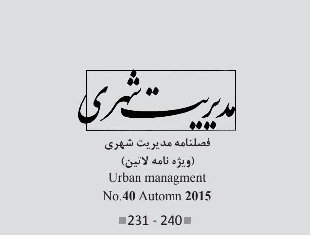
Received 12 Sep 2014; Accepted 11 Aug 2015